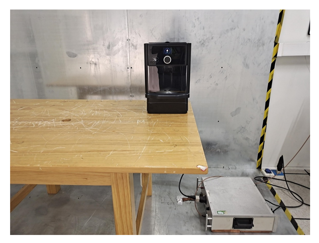
Set-up for Conducted RF test at Antenna Port