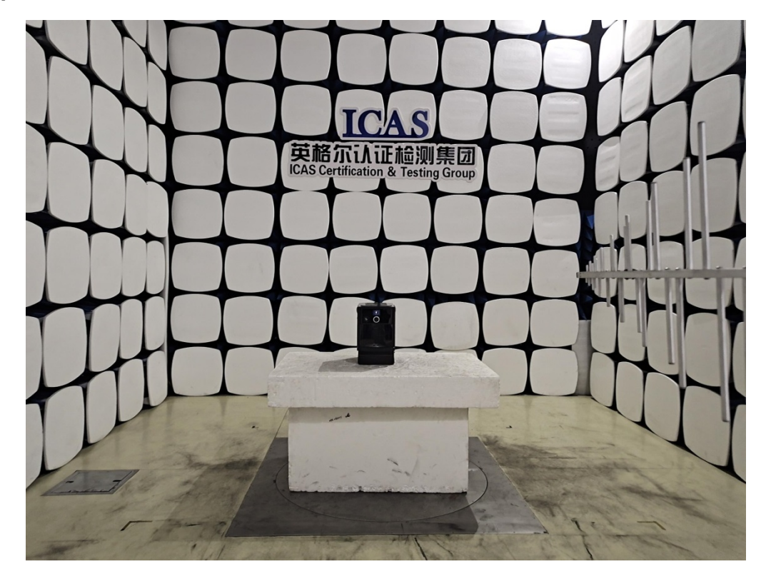
Set-up for Spurious Emissions above 1GHz