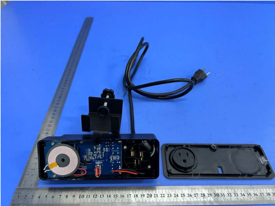
Photo 7 Appearance of PCB