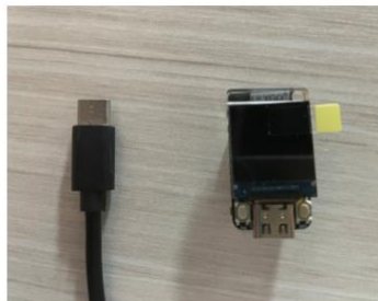
1. Connect the usb