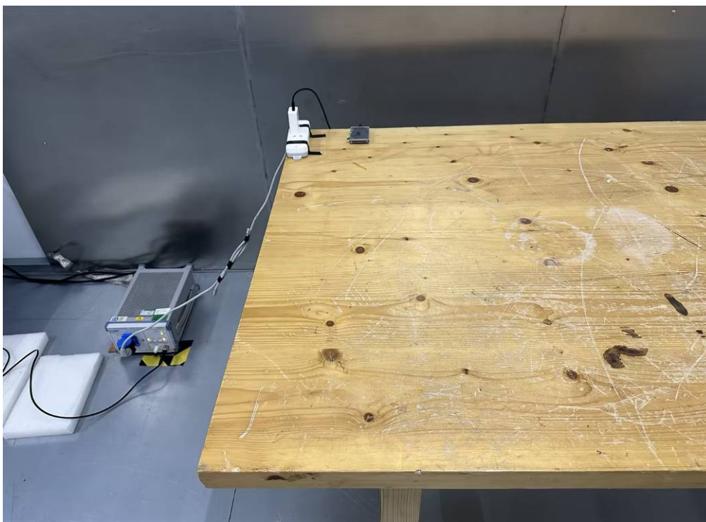
Photo of Conducted Emission Measurement