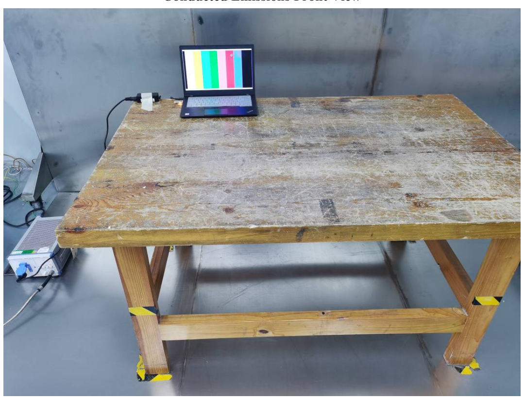
Conducted Emissions Side View