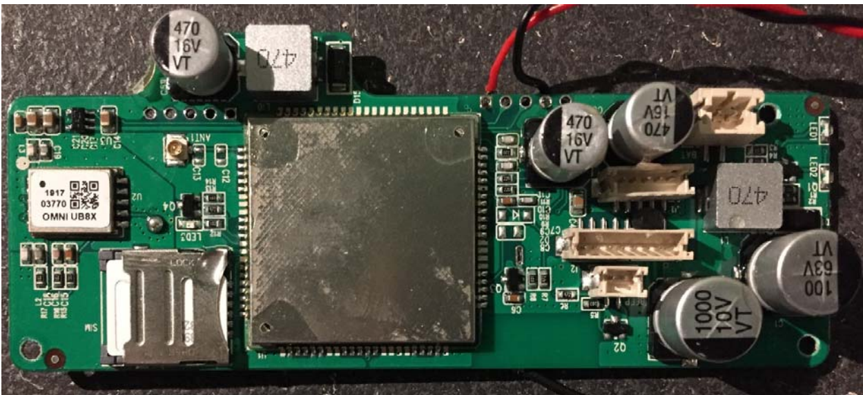
Main Board Top View Cellular and Wifi certified modules occupy this side.