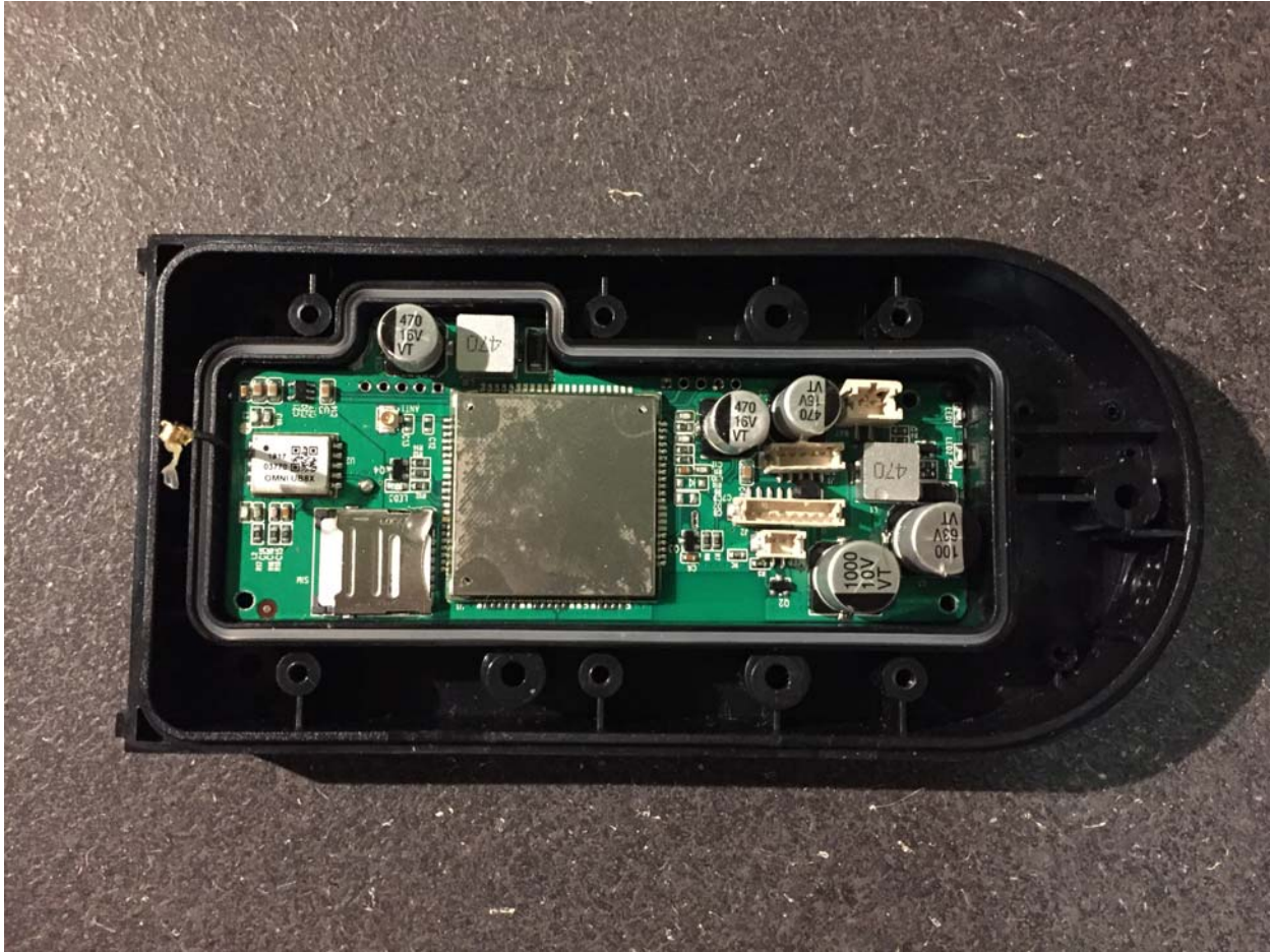
View with Top Cover Removed