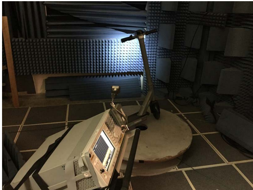
Radiated Spurious 18-25 GHz Setup