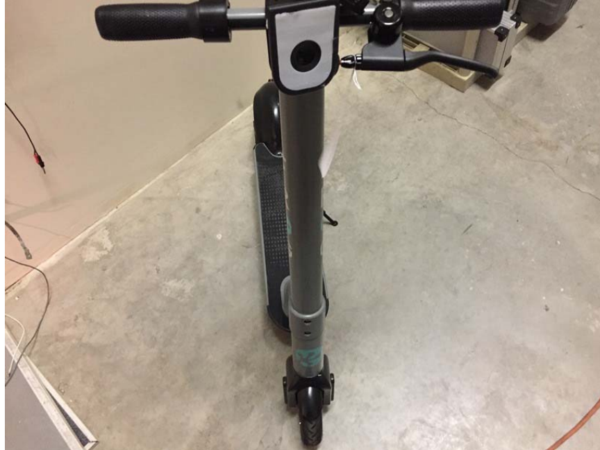
Overall External Appearance, Side 1 of 3