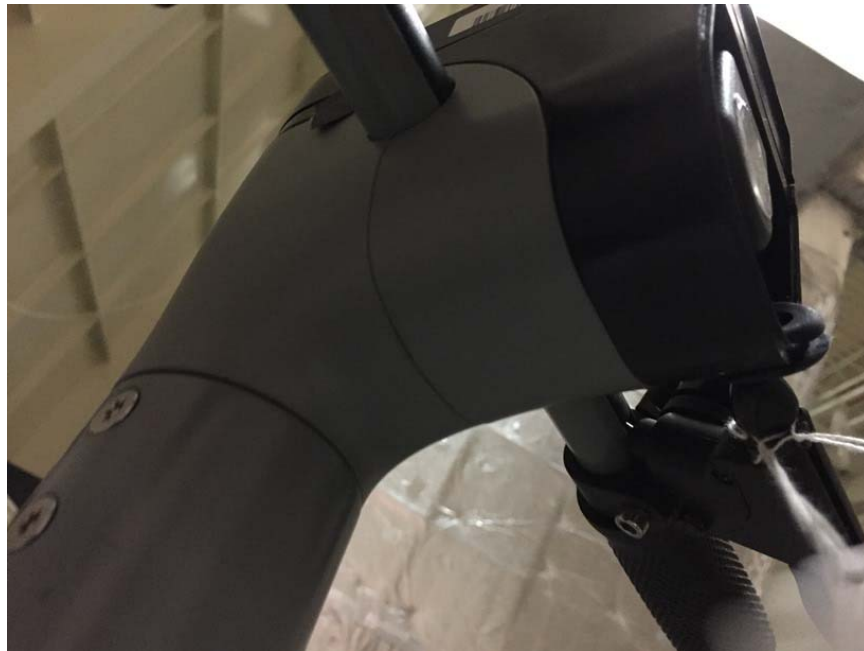
Enclosure for Main Board, Side 4 of 6