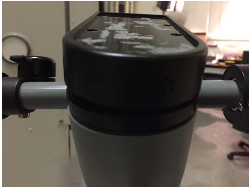
Enclosure for Main Board, Side 2 of 6