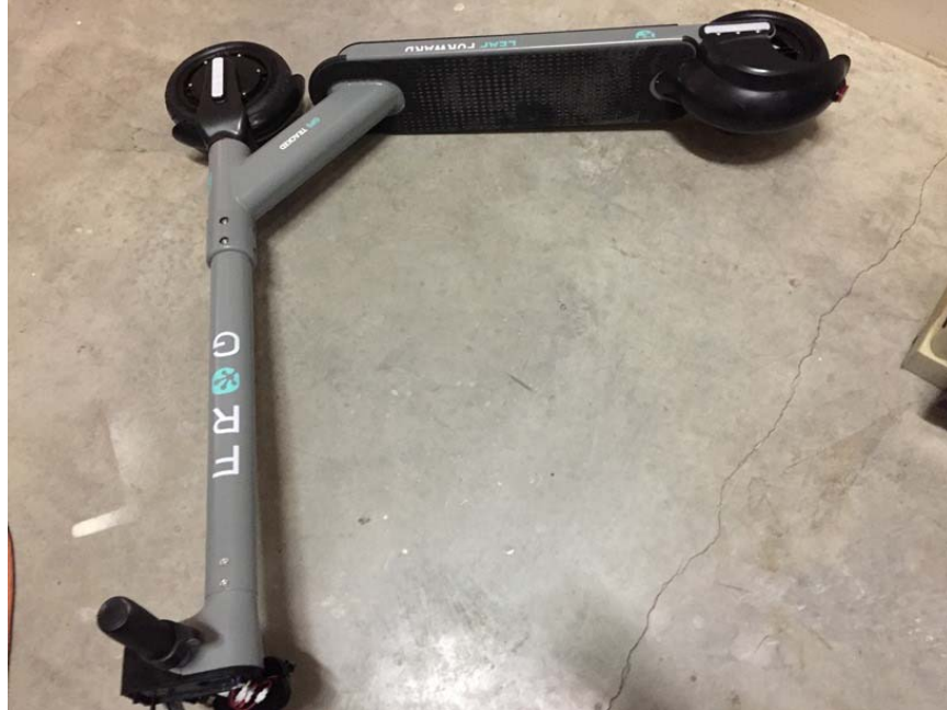
Overall External Appearance, Side 3 of 3