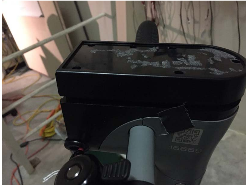
Enclosure for Main Board, Side 3 of 6