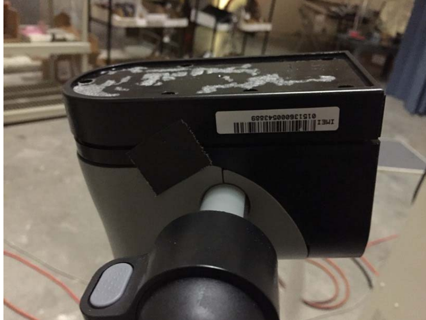
Enclosure for Main Board, Side 1 of 6