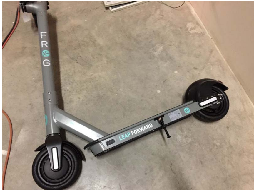
Overall External Appearance, Side 2 of 3 Battery pack is located below the rider platform. Charger connector is visible left of LEAP branding.