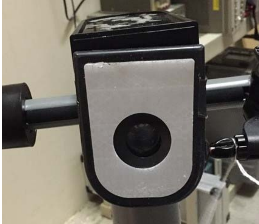
Enclosure for Main Board, Side 5 of 6