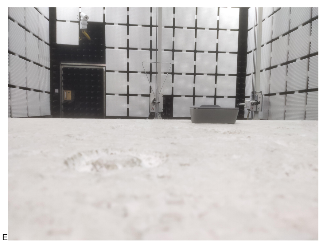
Radiated Emission below 1GHz