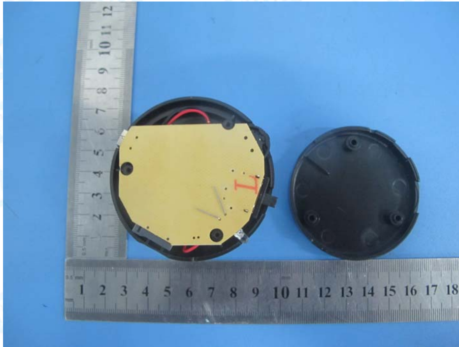
Photo 8 Internal of PCB