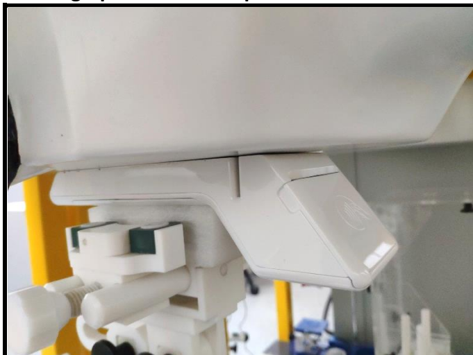
Front Face of EUT with 0 cm Gap