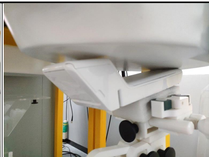
Rear Face of EUT with 0 cm Gap