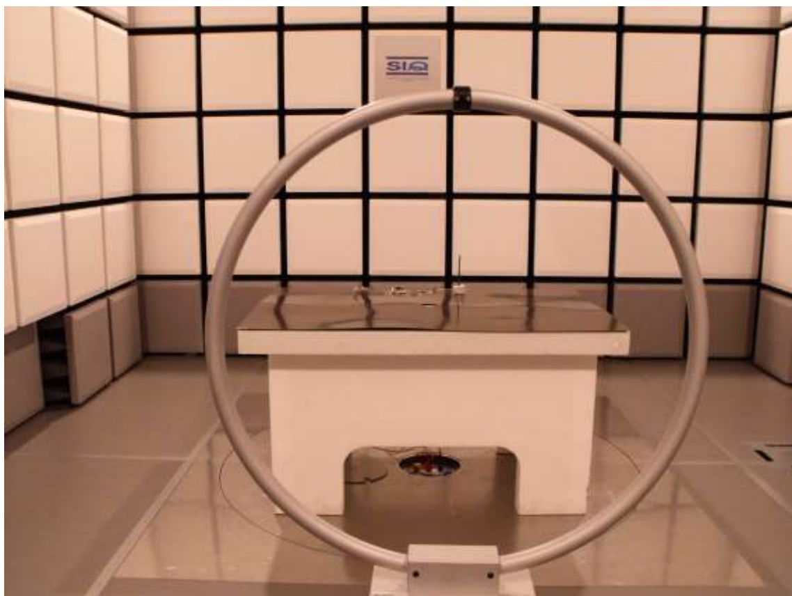
Figure 2: Radiated emission test, 9 kHz – 30 MHz