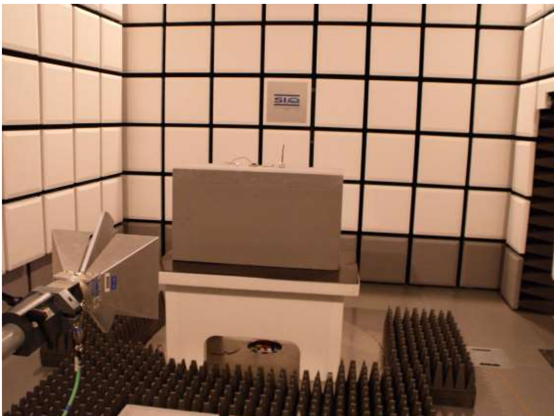
Figure 6: Radiated emission test, 1 GHz – 10 GHz