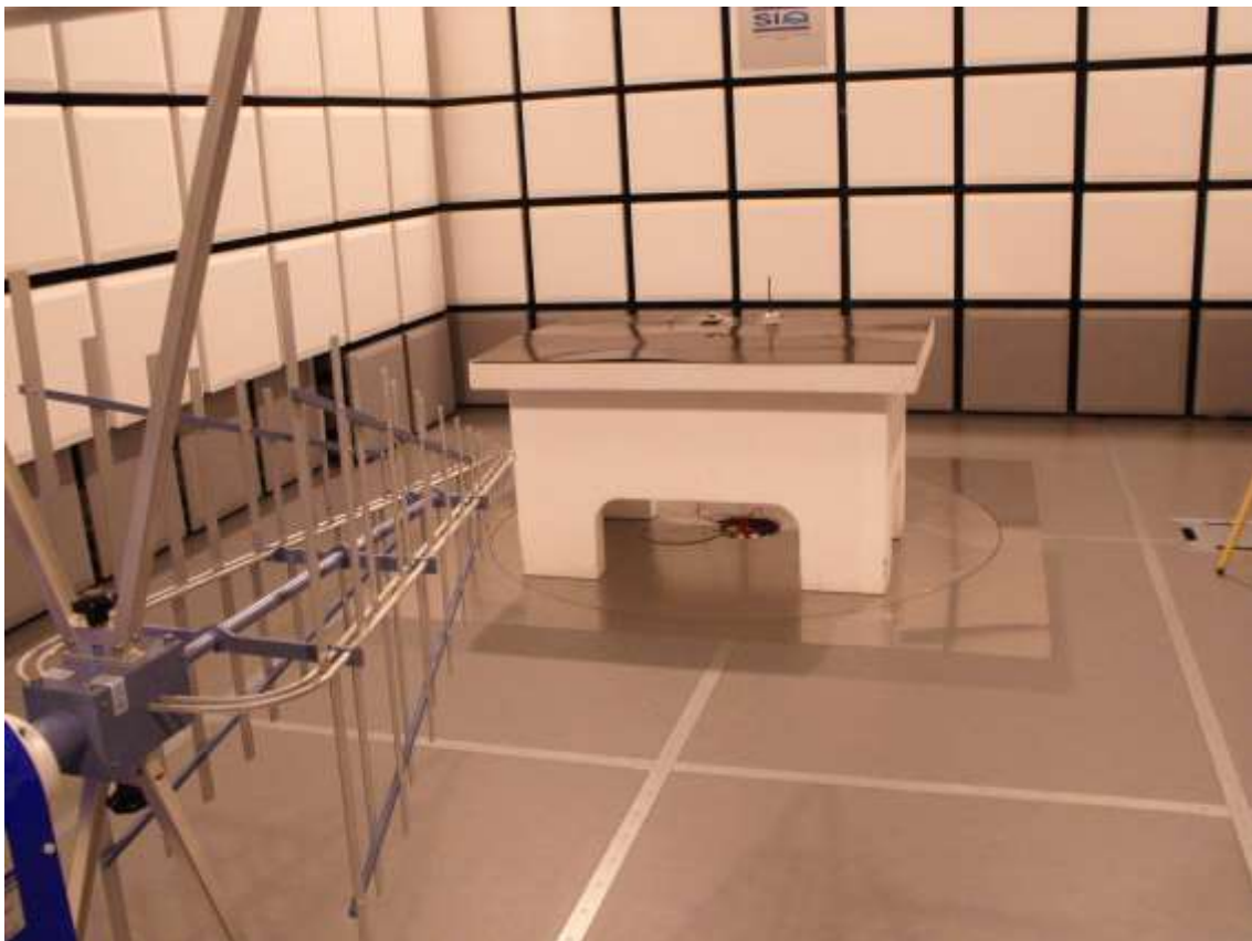
Figure 4: Radiated emission test, 200 MHz – 1 GHz