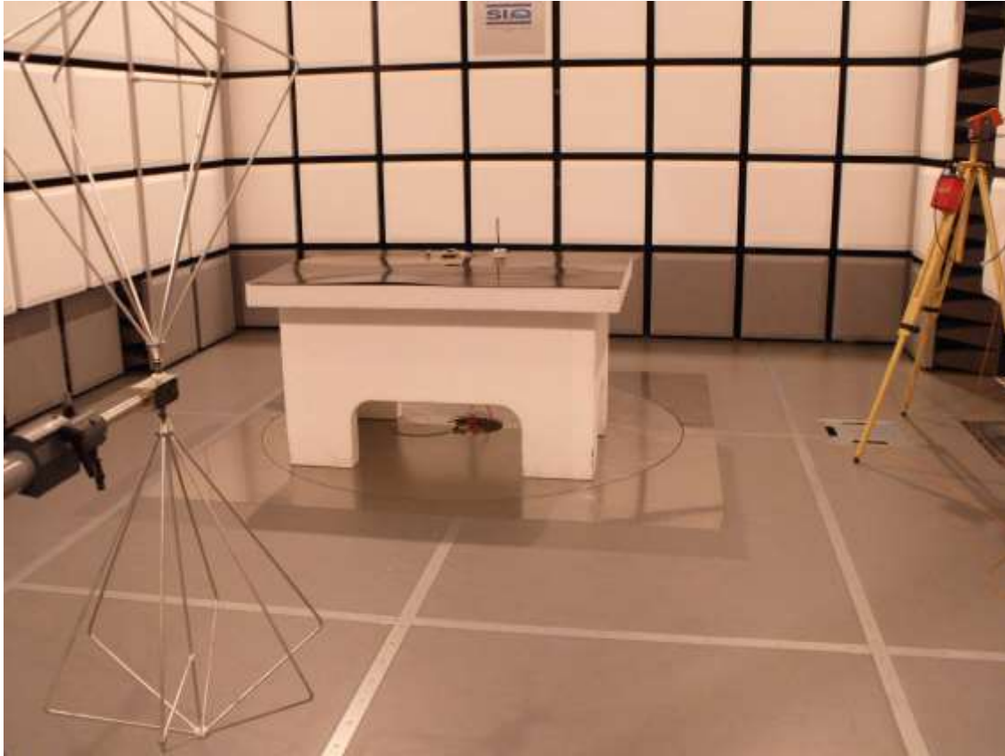
Figure 3: Radiated emission test, 30 MHz – 200 MHz