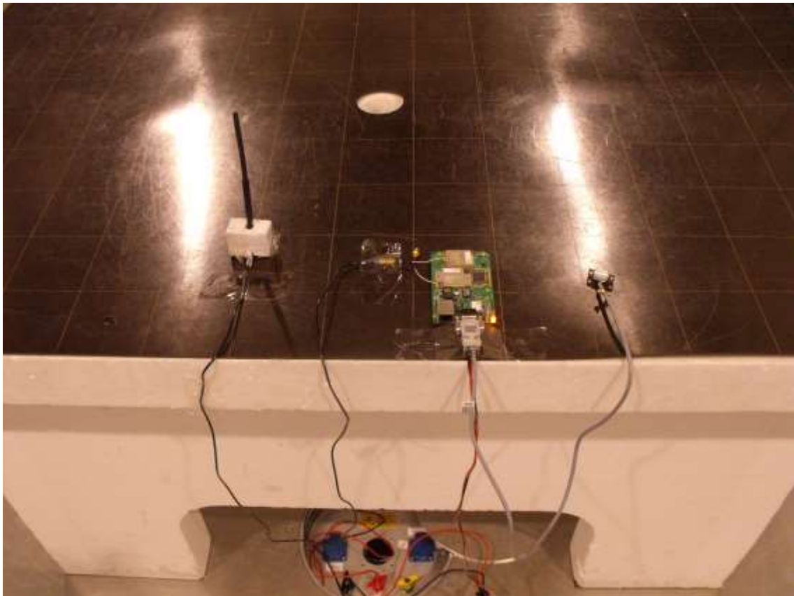
Figure 5: Radiated emission test, 200 MHz – 1 GHz