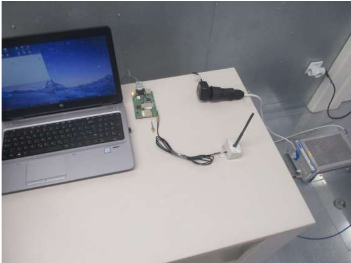
Figure 1: Conducted emission test