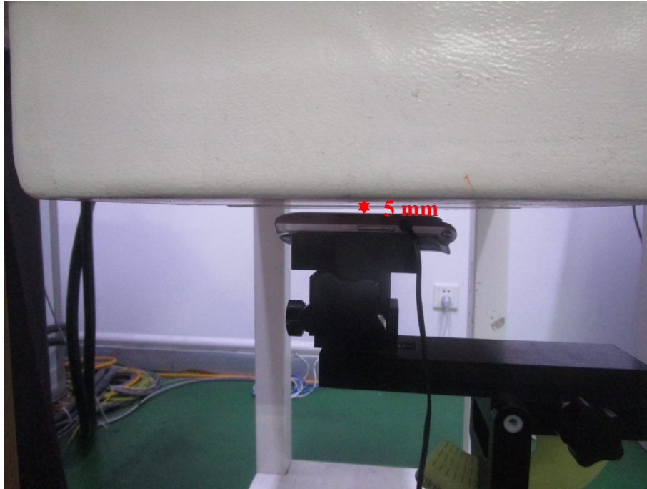
Body Back Setup Photo (5mm)