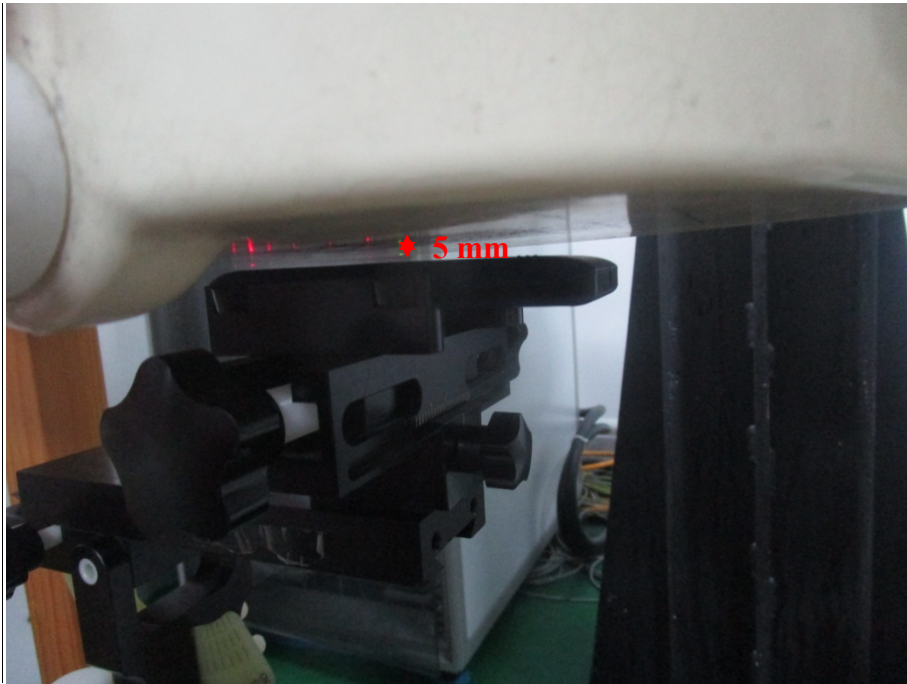
Body (Worn) Front Setup Photo (5mm)