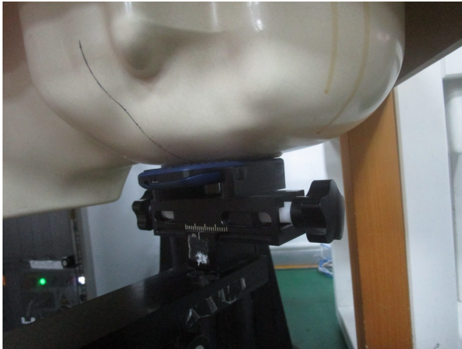
Head Left Tilt Setup Photo