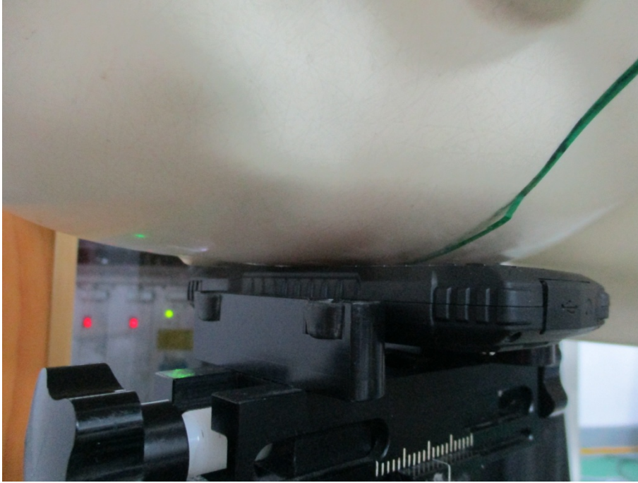
Head Right Tilt Setup Photo