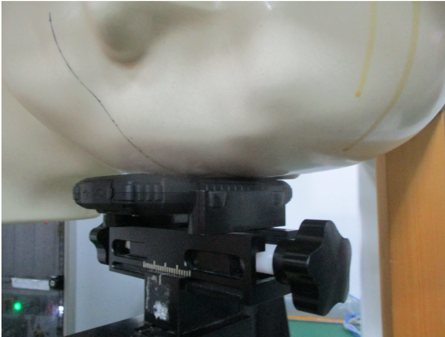
Head Left Tilt Setup Photo