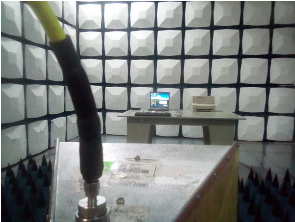
Radiated Emissions Above 1G Rear View