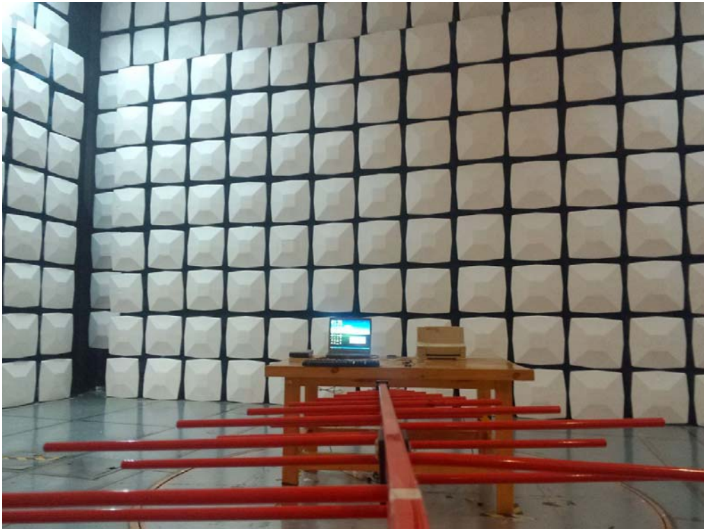
Radiated Emissions Below 1G Rear View