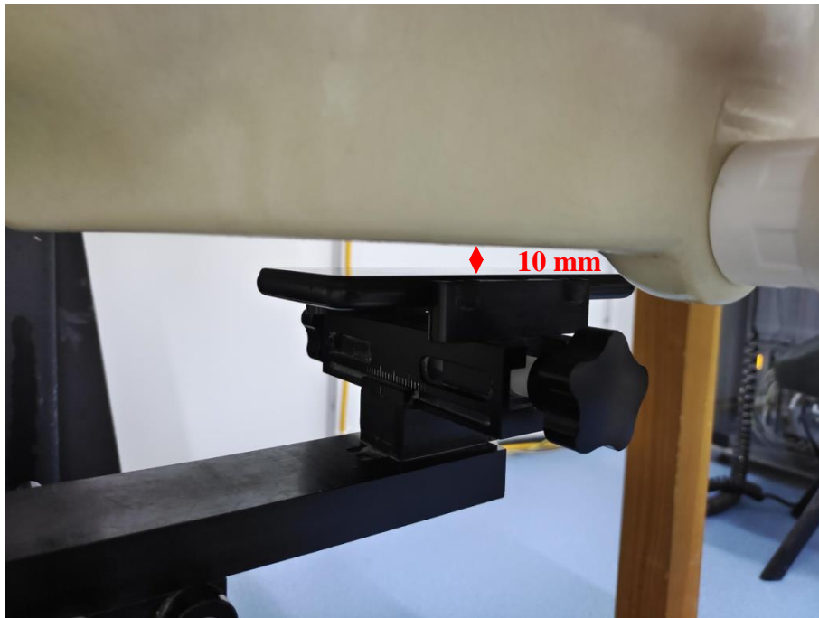
Body (Worn) Back Setup Photo (10mm)