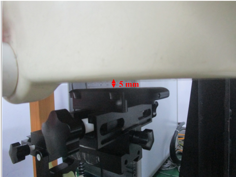
Body (Worn) Front Setup Photo (5mm)