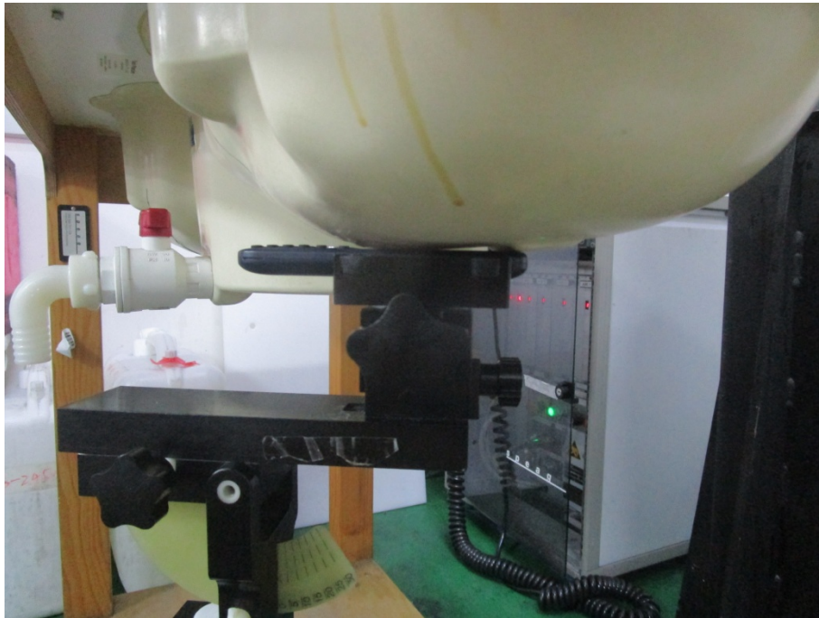
Head Left Tilt Setup Photo