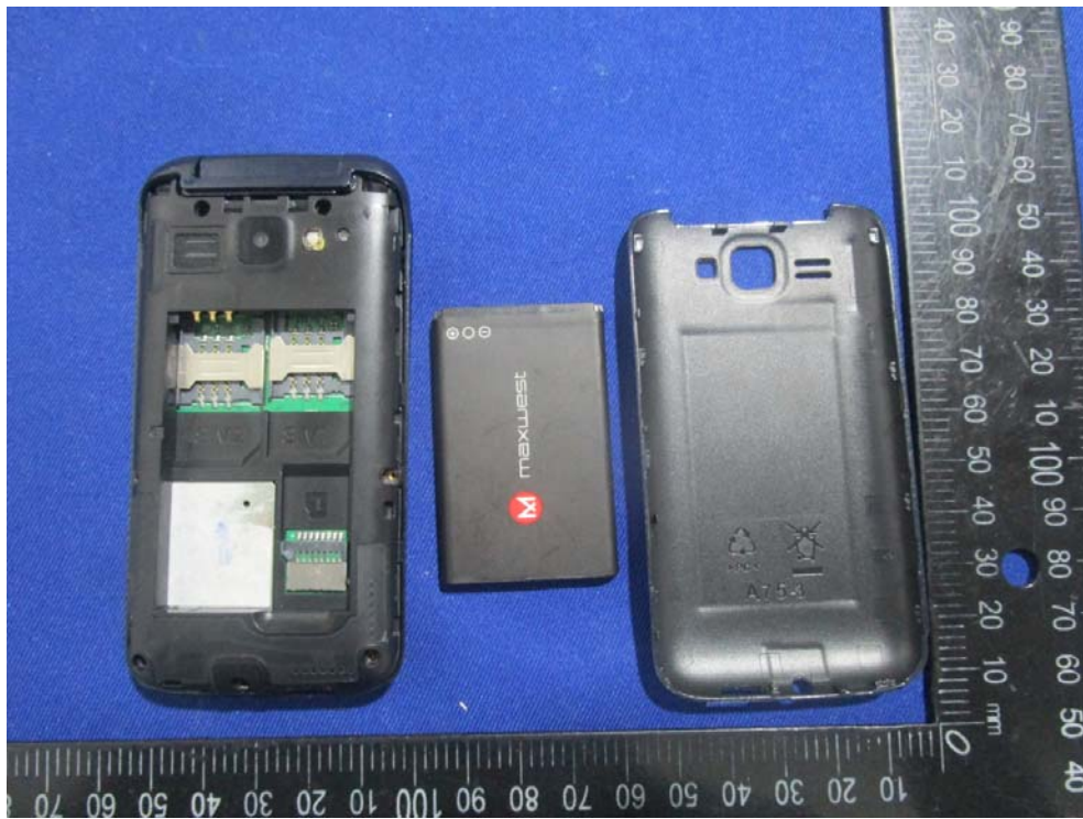
EXHIBIT C - EUT INTERNAL PHOTOGRAPHS