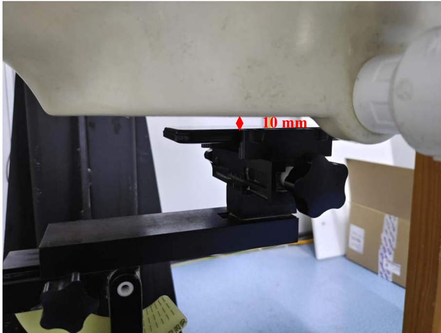
Body (Worn) Back Setup Photo (10mm)