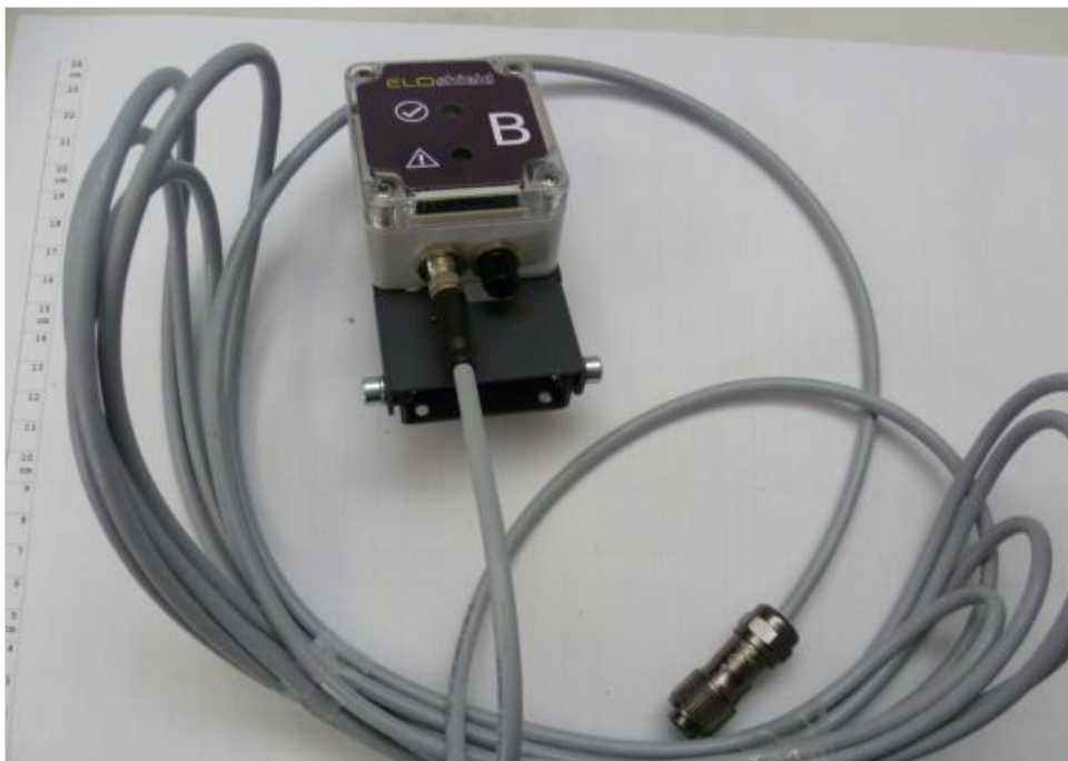
Photograph 3: CAN bus cable (CAB2)