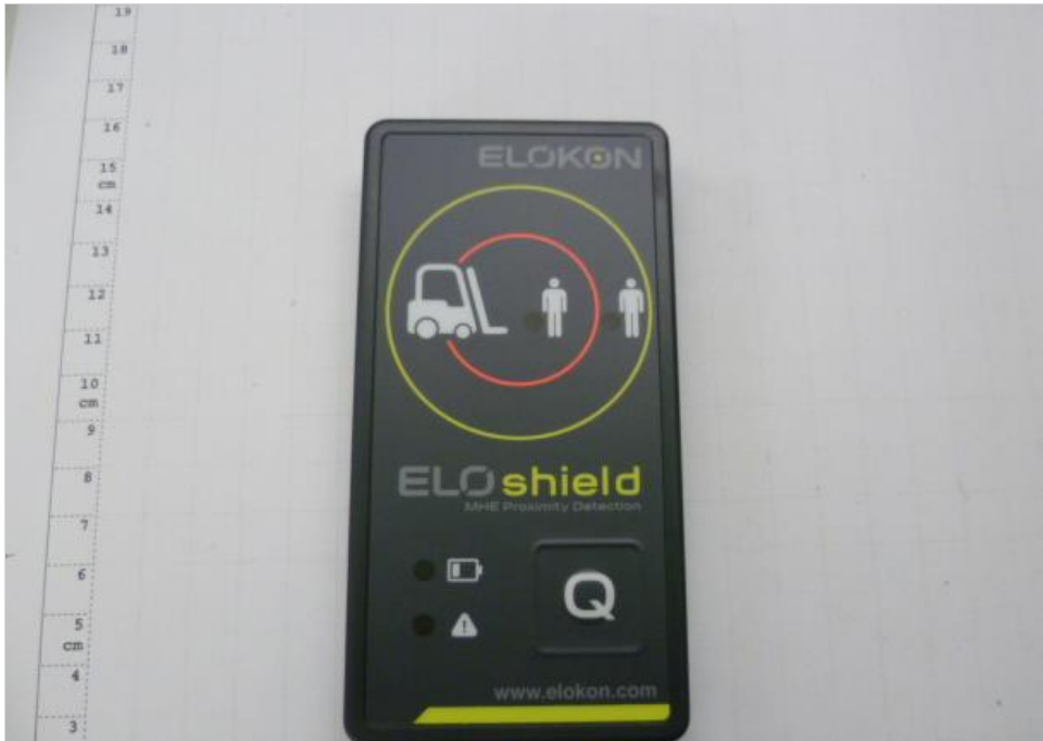
Photograph 2: AE1 – pedestrian badge