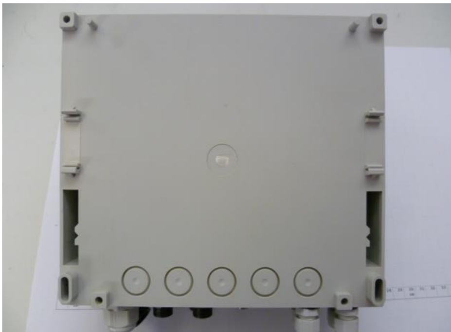
Photograph 2: EUT 1_Rear side view