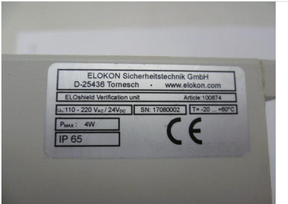
Photograph 4: EUT type marking