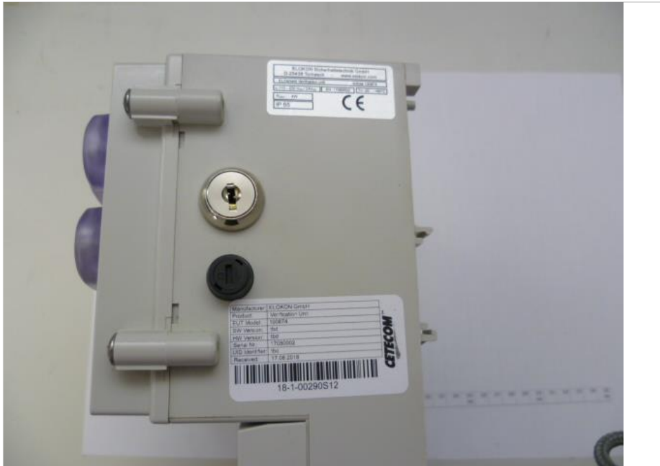
Photograph 3: EUT 1_Left side view