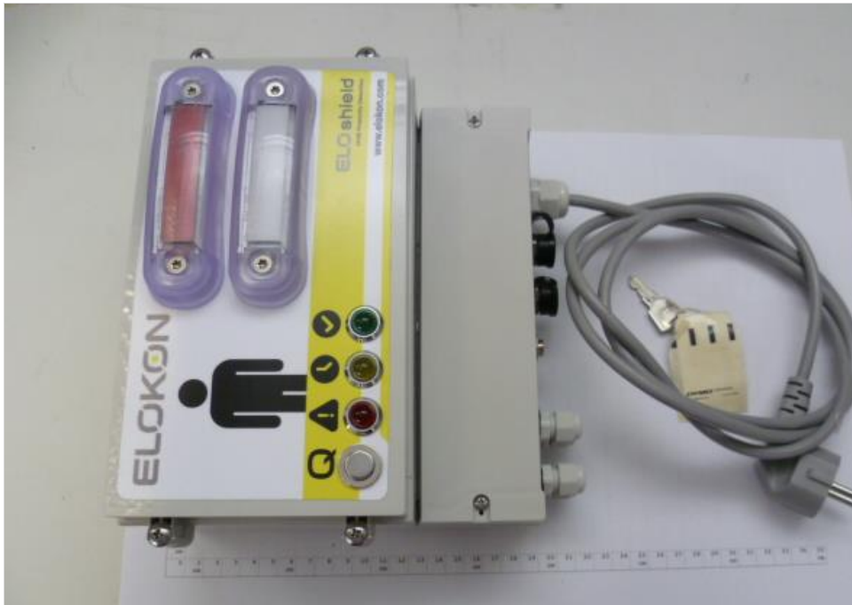
Photograph 1: EUT 1_Top view