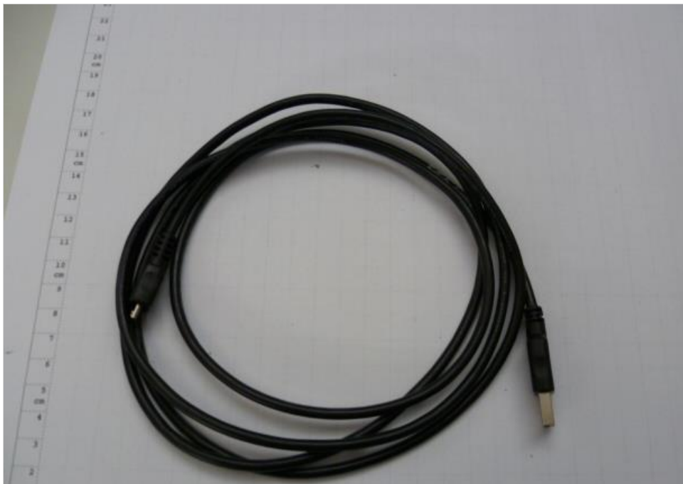
Photograph 3: CAB1 - USB cable