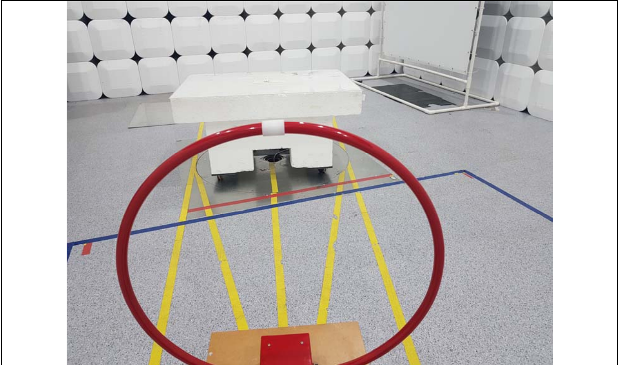
Test distance : 3 m, height of table : 0.8 m