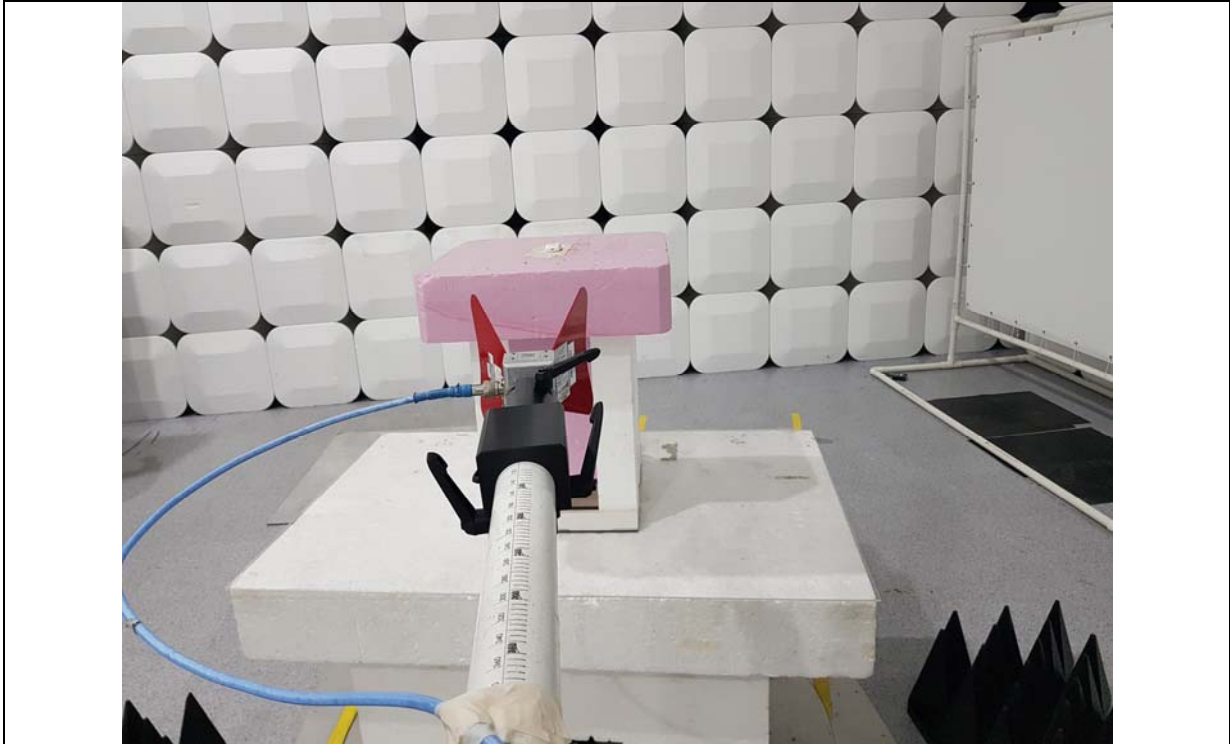
Test distance : 1 m, height of table : 1.5 m