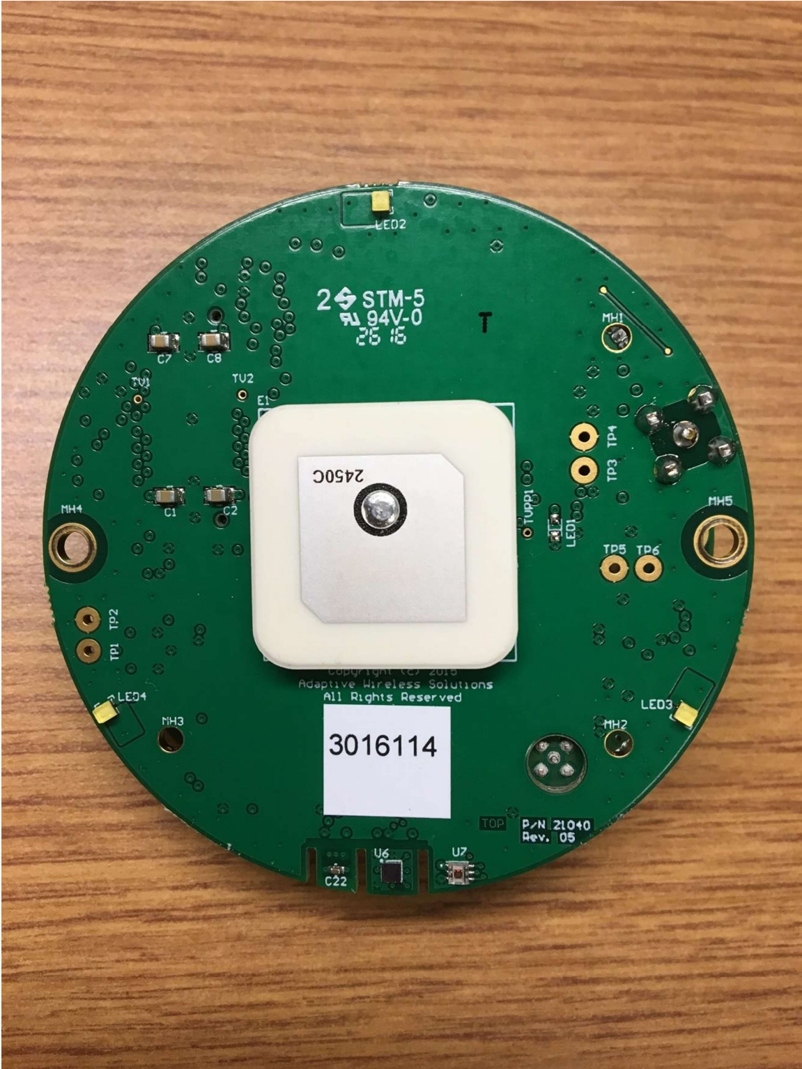
Top of RF PCB (BLE WLP.2450.25.4.A.02 antenna)