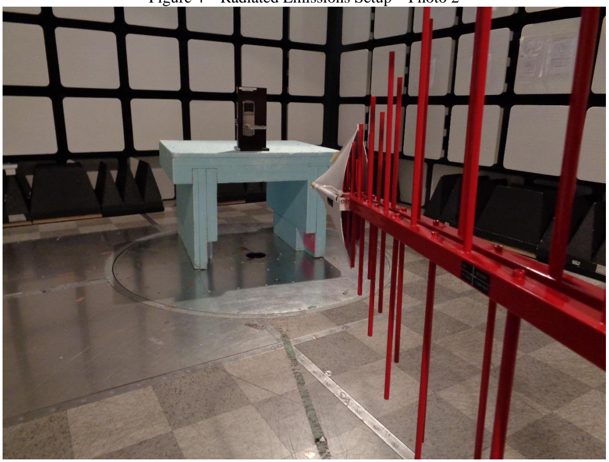
Figure 4 – Radiated Emissions Setup – Photo 2