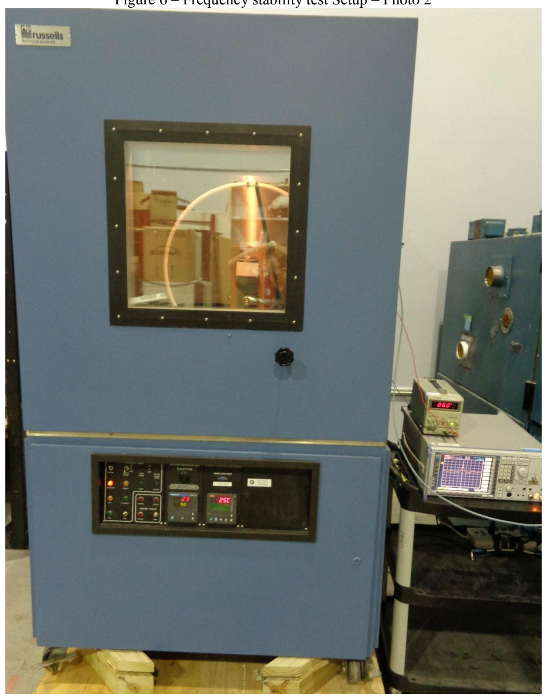
Figure 6 – Frequency stability test Setup – Photo 2