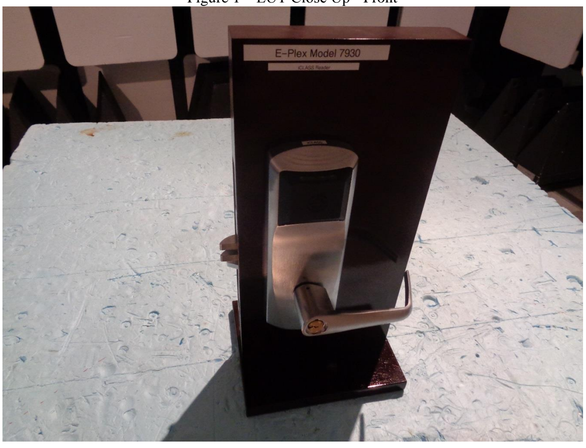
Figure 1 – EUT Close Up - Front