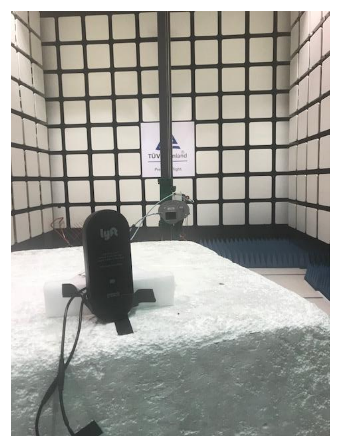
Test Setup 18-26G Rear