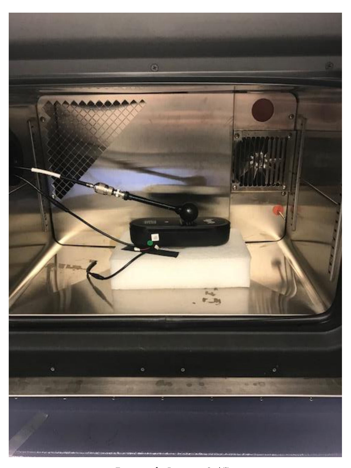
Test setup for Frequency Stability