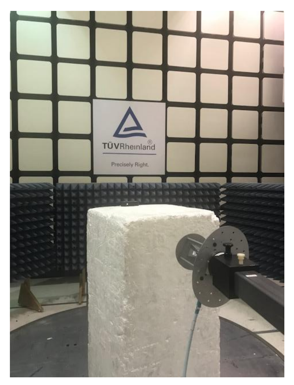
Test Setup 18-26G Front