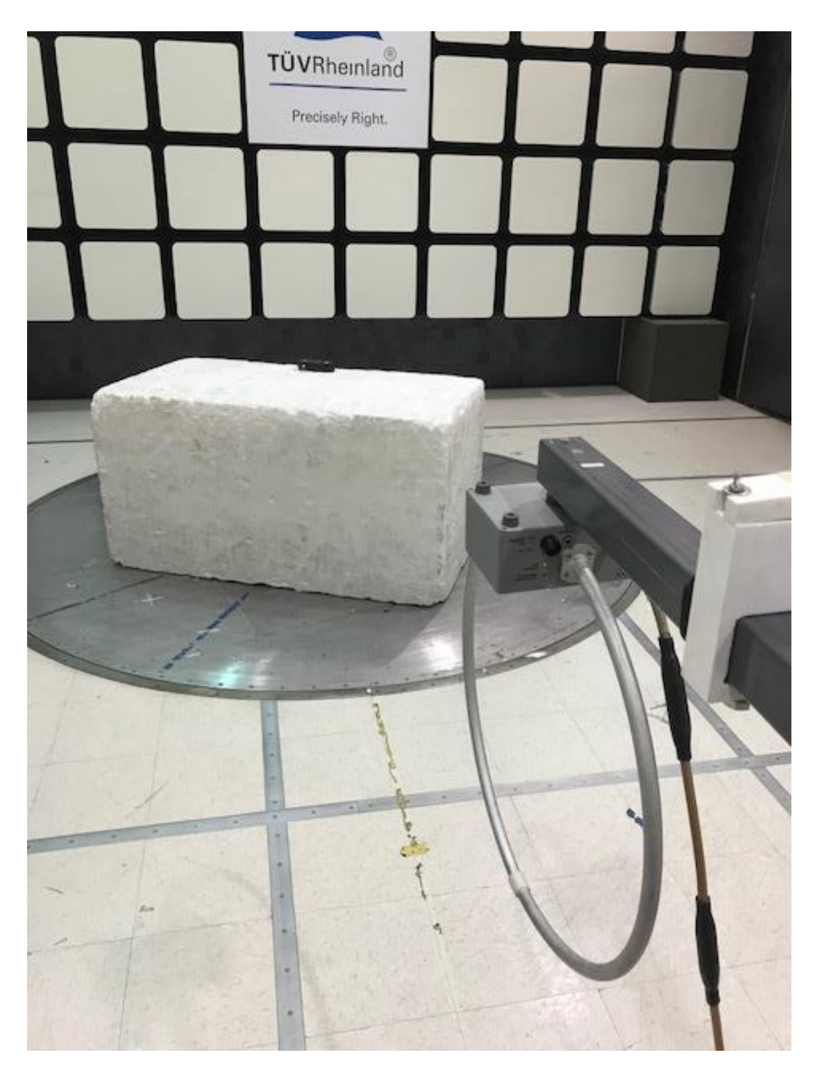
Test setup 9k to 30M Front