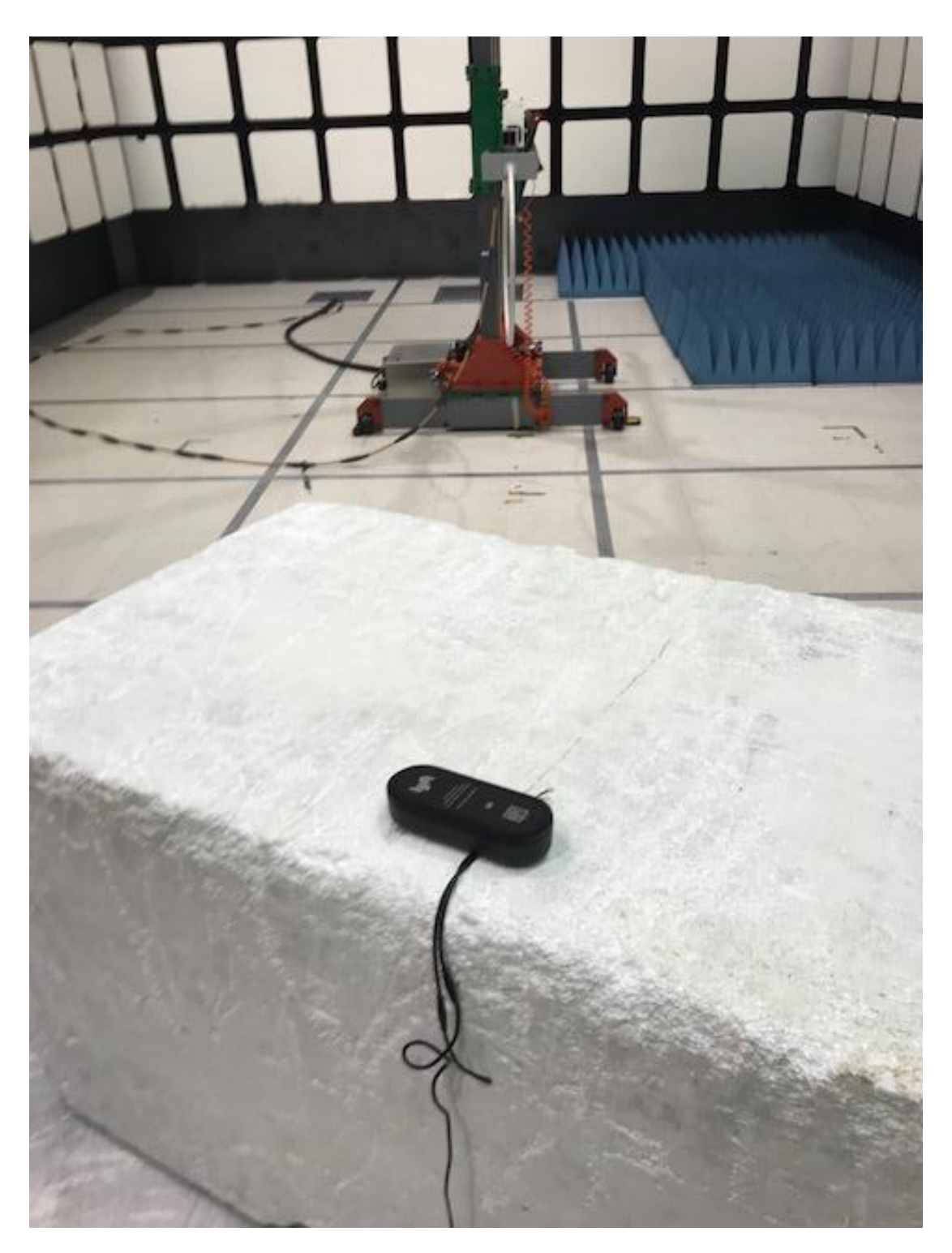
Test setup 9k to 30M Rear