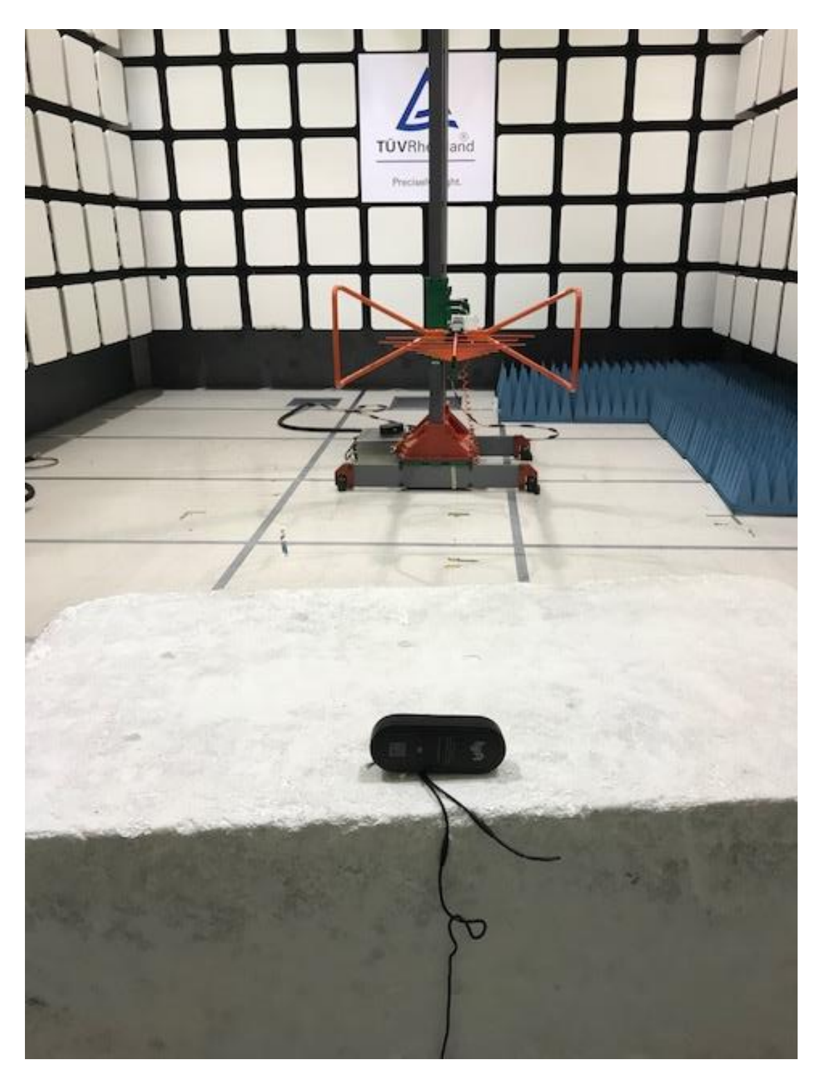
Test Setup 30-100M Rear