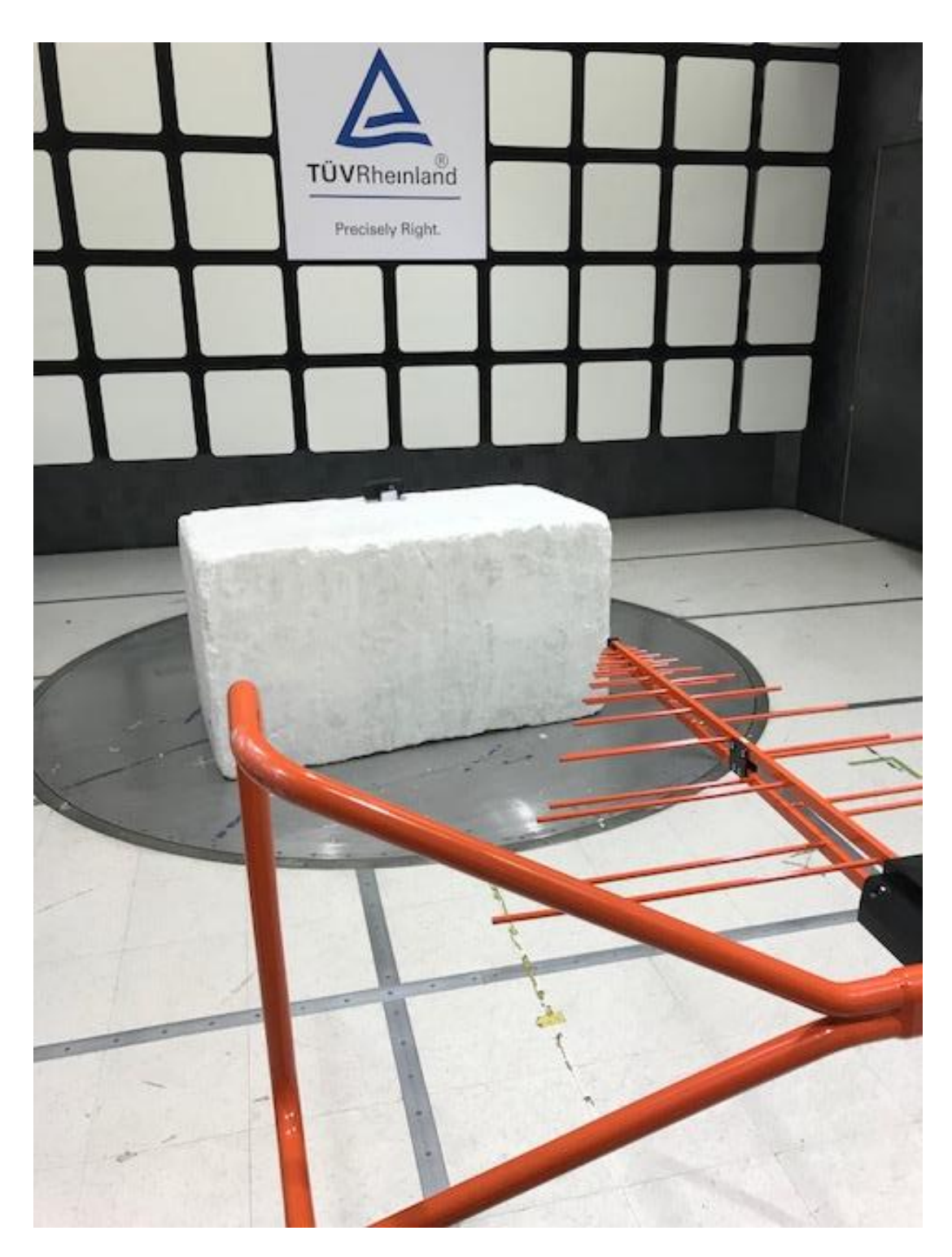
Test Setup 30-1000M Front