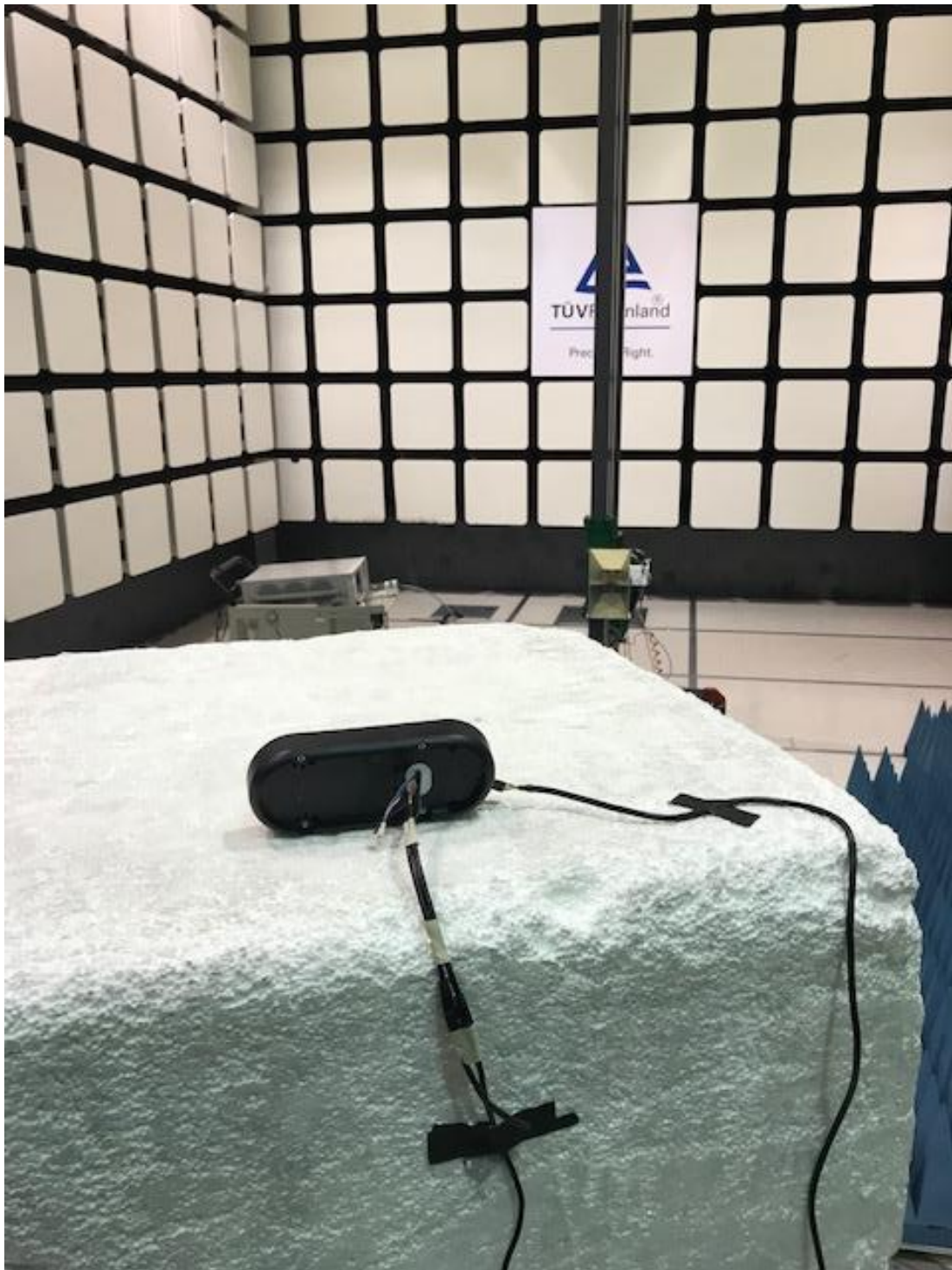
Test Setup 1-18G Rear