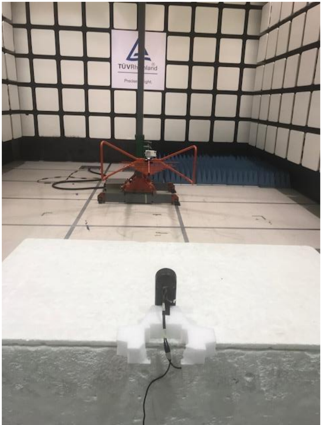
Test Setup 30-1000 Rear