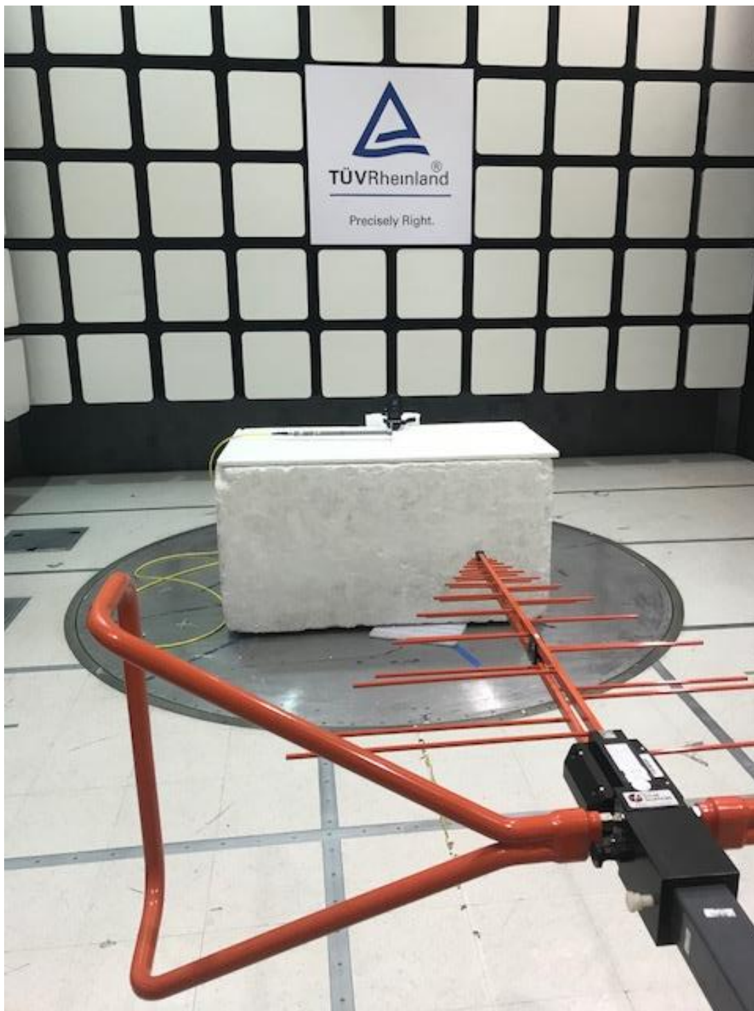
Test Setup 30-1000M Front