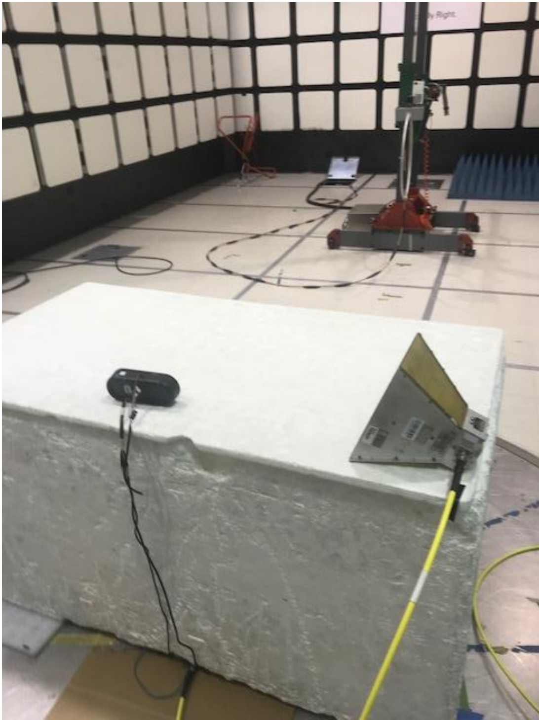
Test Setup 9k to 30M Rear