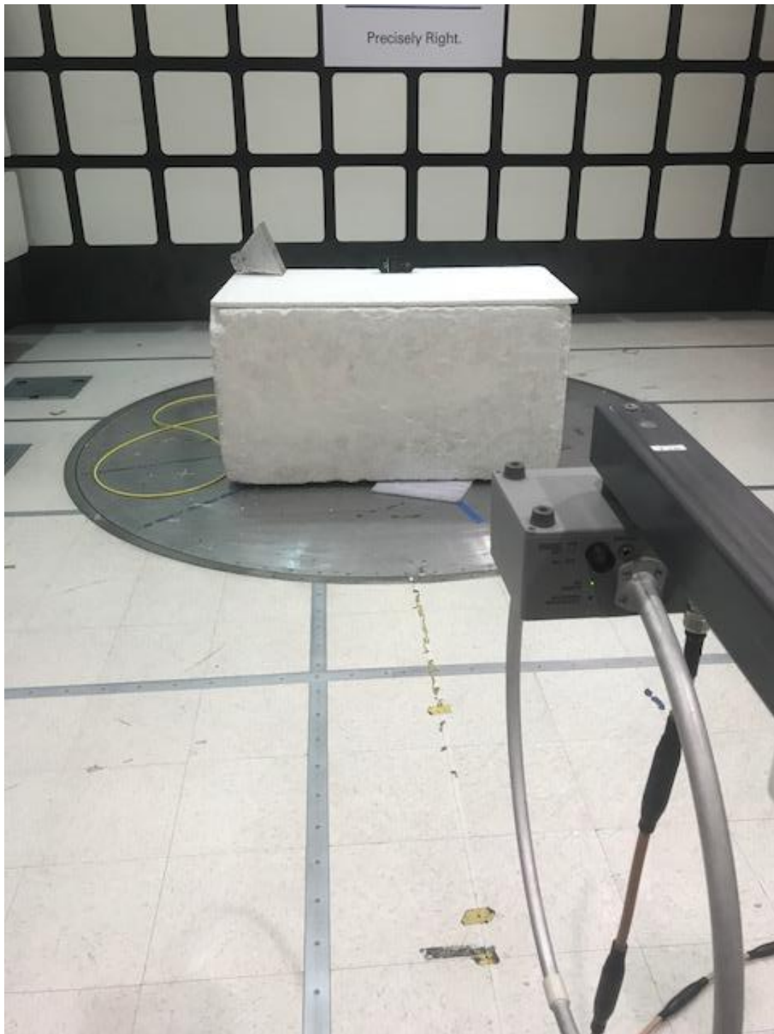
Test setup 9k to 30M Front