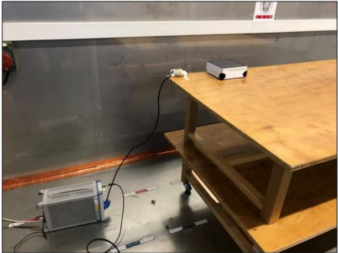
Test setup – Configuration n°2 (charging mode)