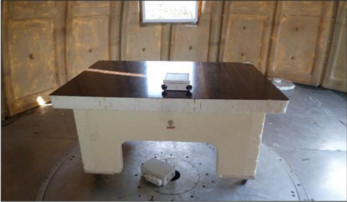
Test setup on OATS – Configuration n°1