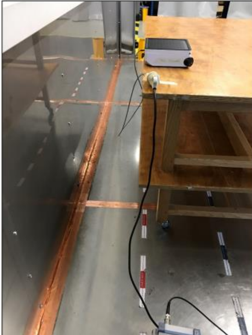
Test setup – Configuration n°2 (charging mode)

LCIE SUD EST Laboratoire de Moirans Z.I. Centr'Alp 170, Rue de Chatagnon 38430 MOIRANS - FRANCE