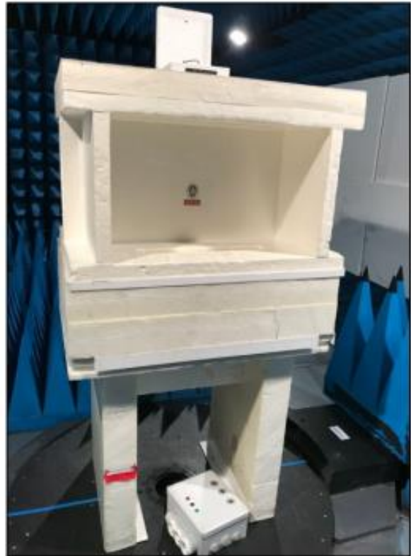
Test setup in anechoic chamber – Configuration n°3 – Wifi