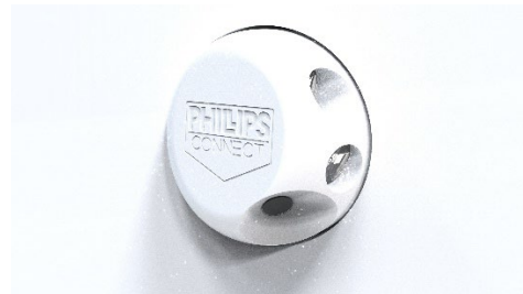
Interior View (Mounted)