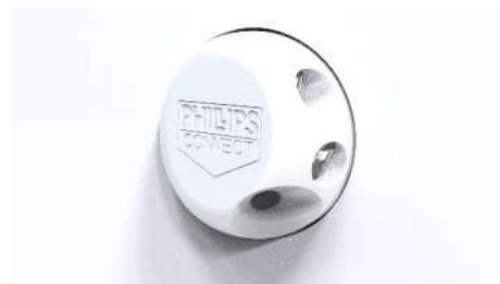
Interior View (Mounted)