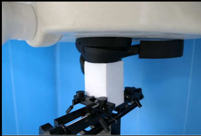
Right Ear of Earphone Tested at 0 mm