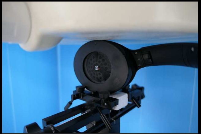
Rear Face of Earphone Tested at 0 mm