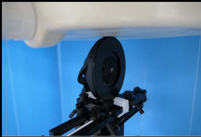
Bottom Side of Earphone Tested at 0 mm