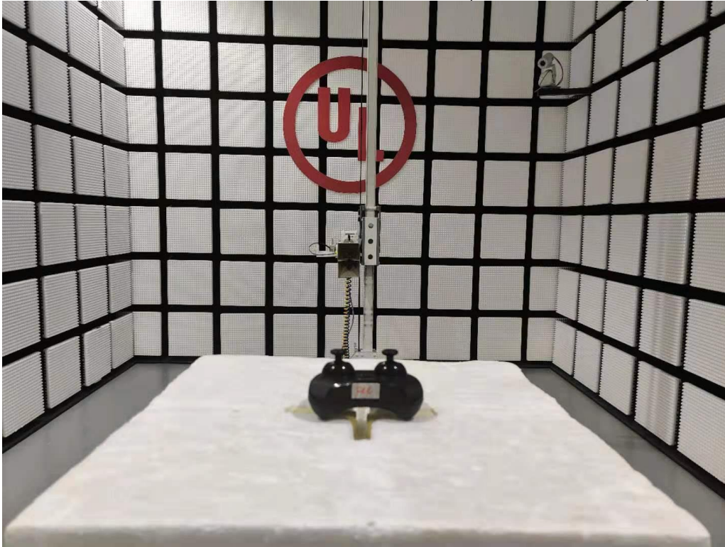
RADIATED RF MEASUREMENT SETUP (Above 1G – Y axis)