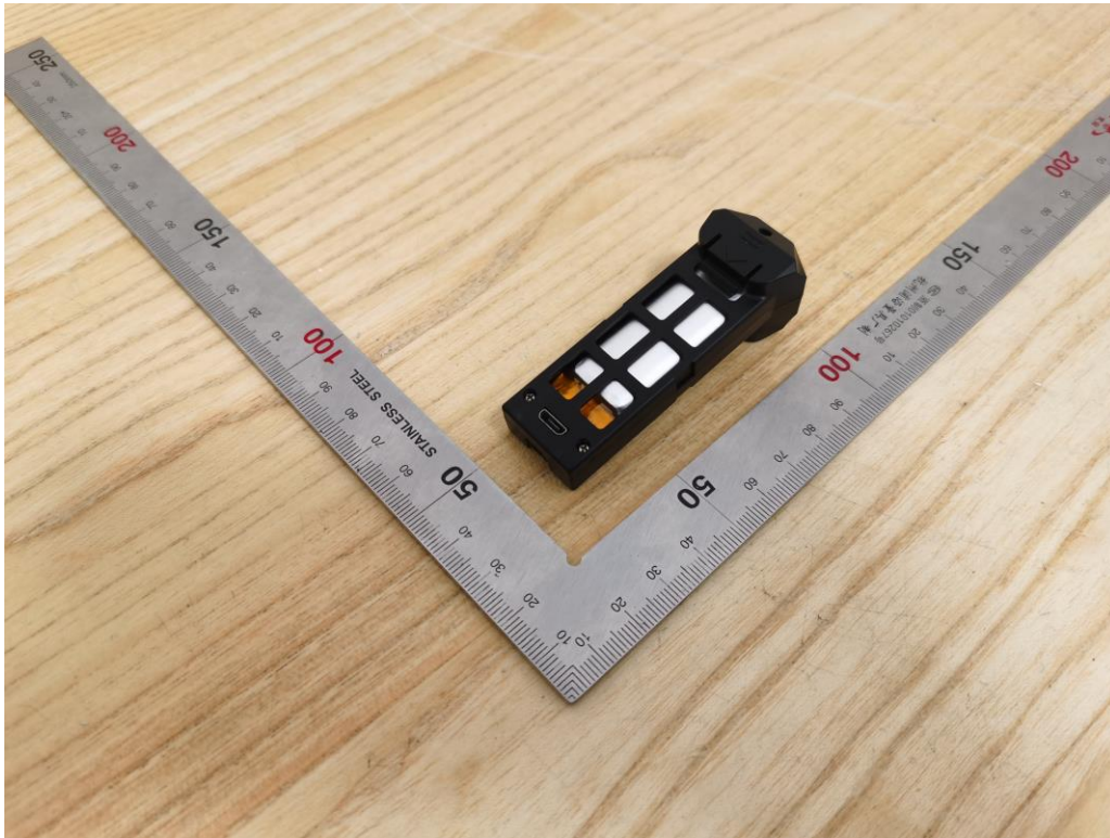
View of Battery-2