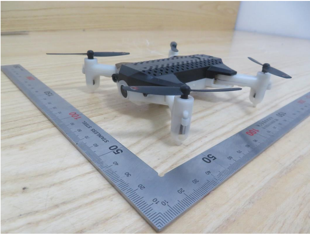
View of EUT-2