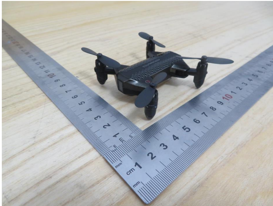
View of EUT-4