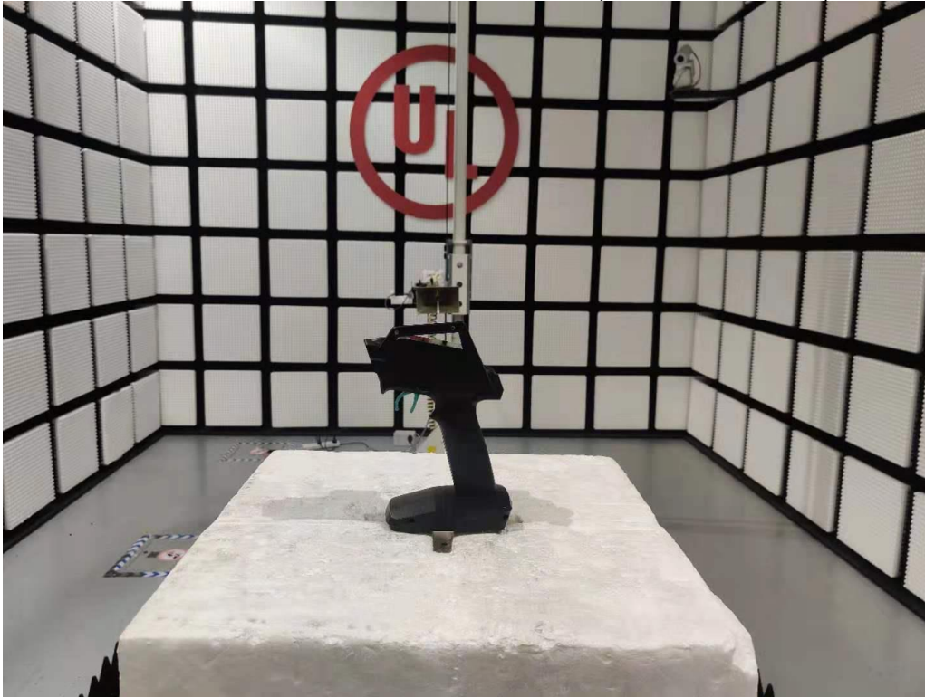
RADIATED RF MEASUREMENT SETUP (Above 1G – Y axis)