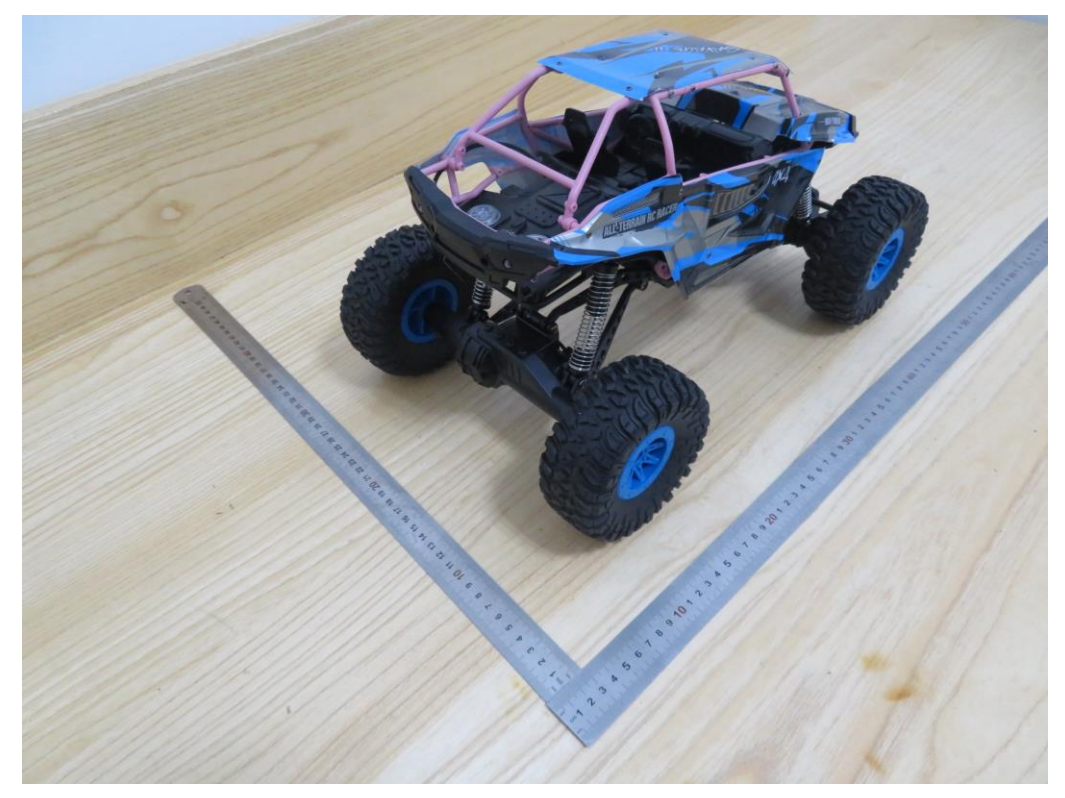
View of EUT-2