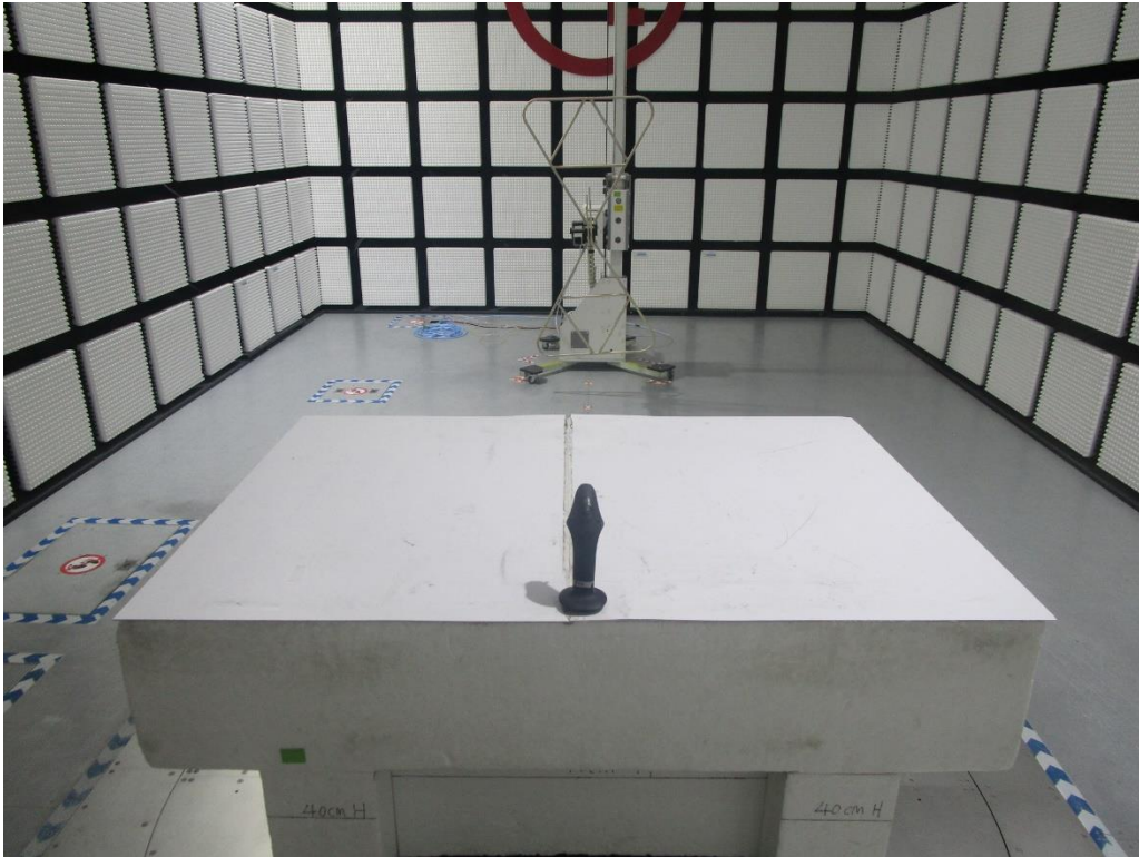
Radiated Disturbance below 30 MHz