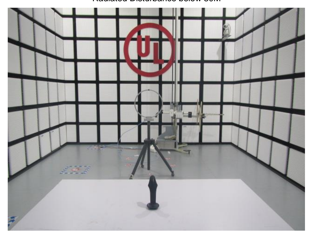
Radiated Disturbance below 30M