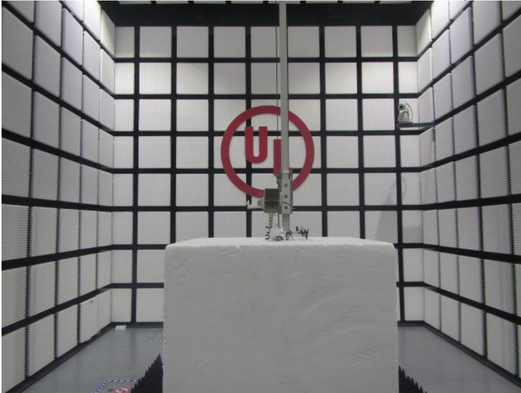
RADIATED RF MEASUREMENT SETUP (Above 1G – Z axis)