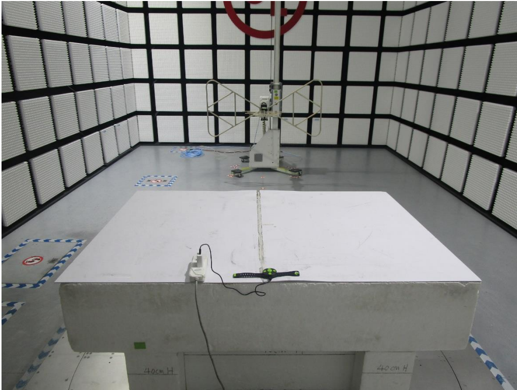
Radiated Disturbance below 30 MHz