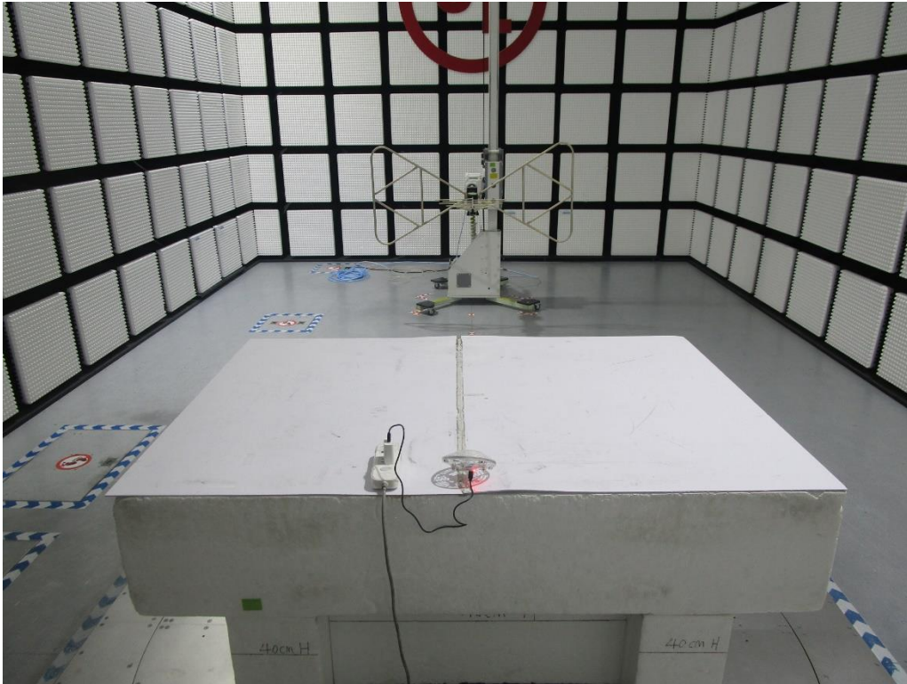
Radiated Disturbance below 30 MHz