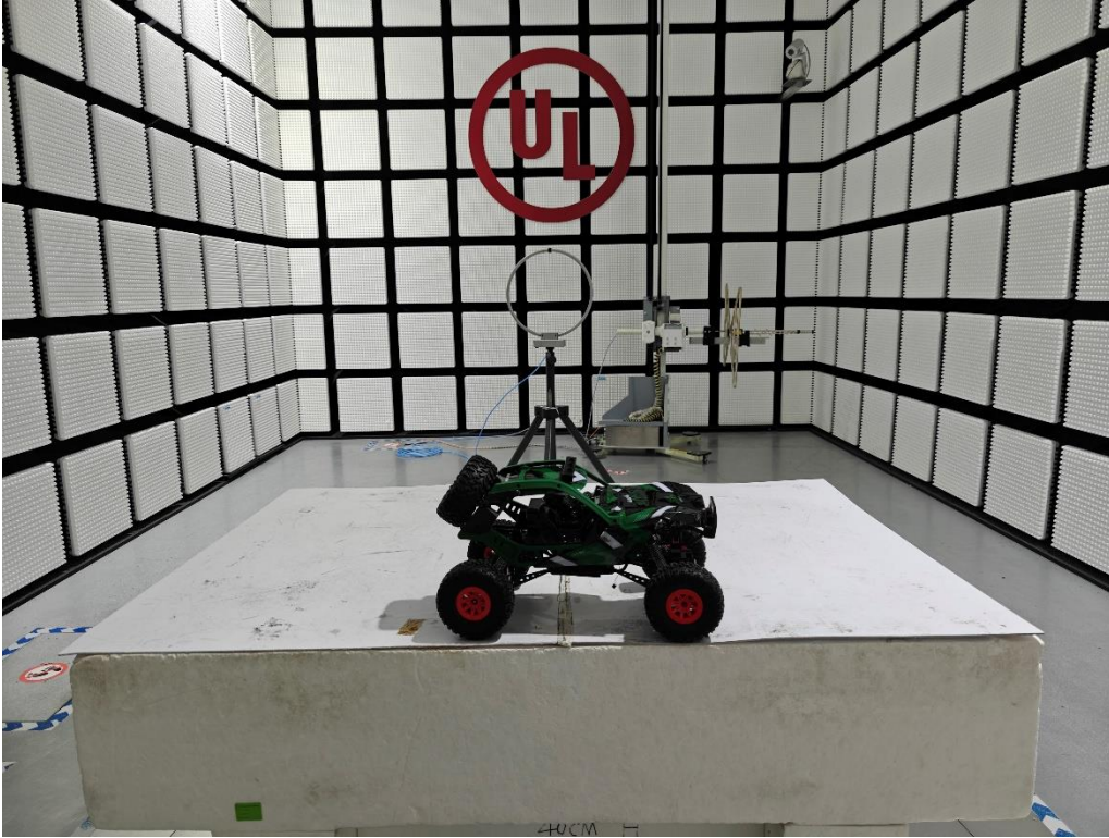
Radiated Disturbance Setup ( above 1GHz)