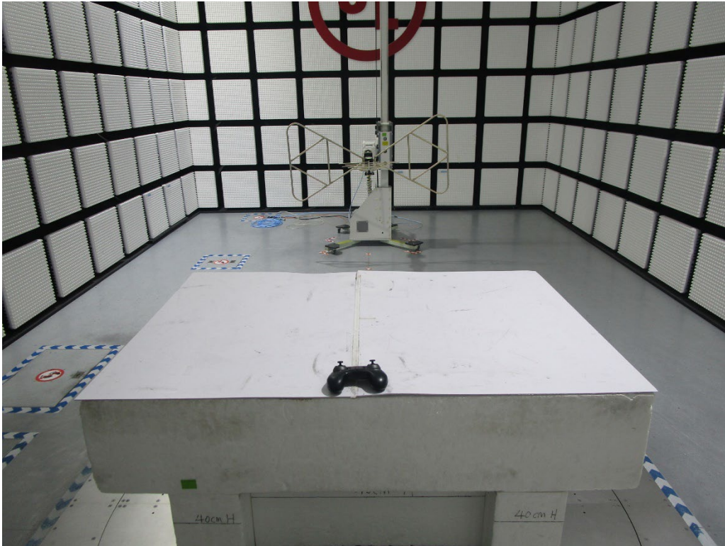
Radiated Disturbance below 30 MHz