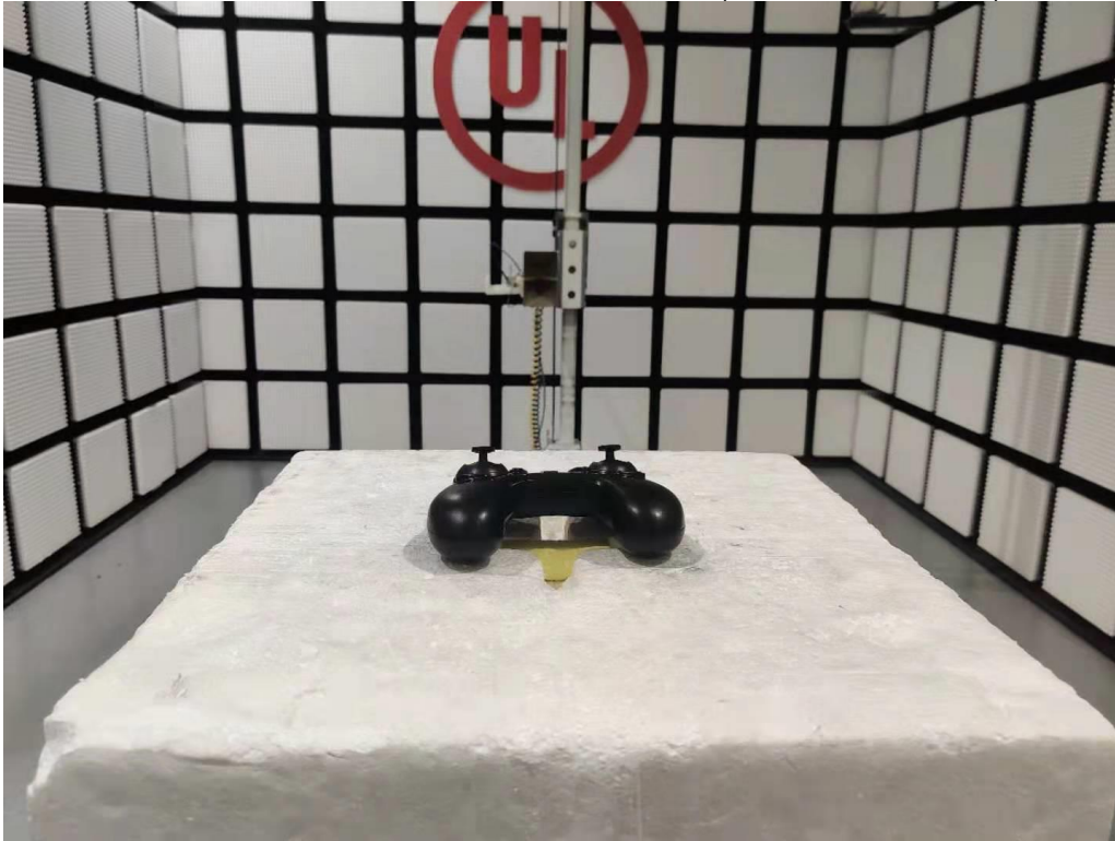
RADIATED RF MEASUREMENT SETUP (Above 1G – Y axis)