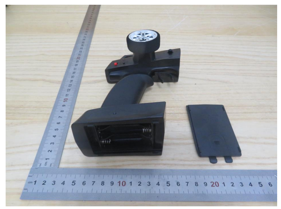
Internal View of EUT-2