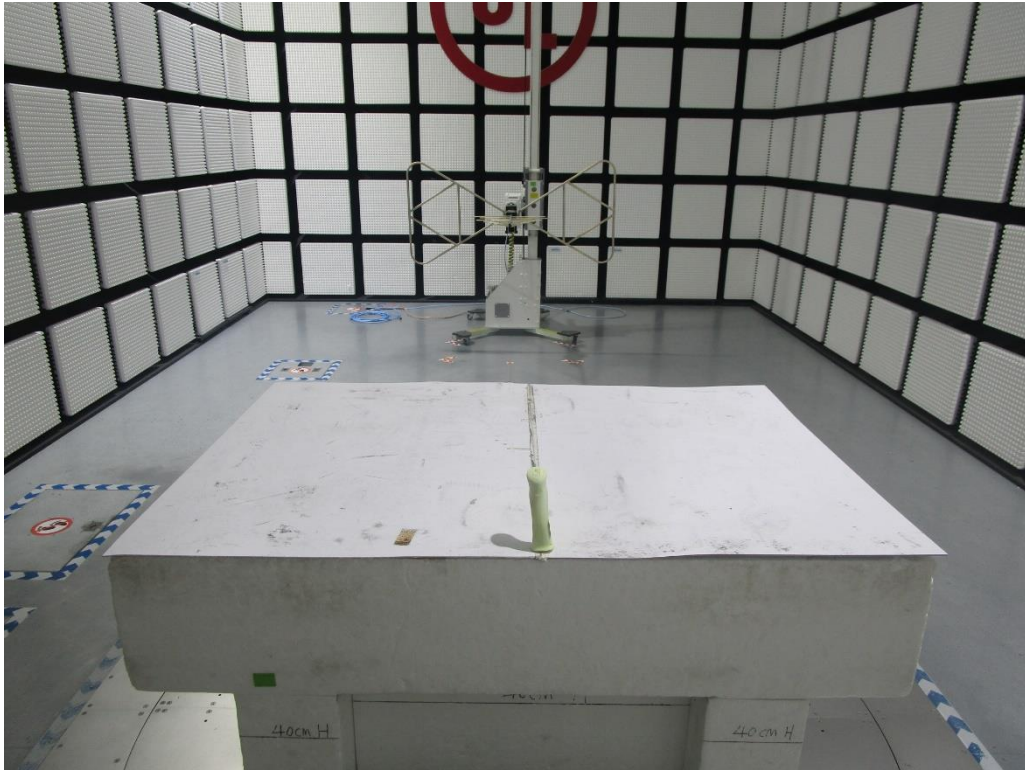
Radiated Disturbance below 30 MHz