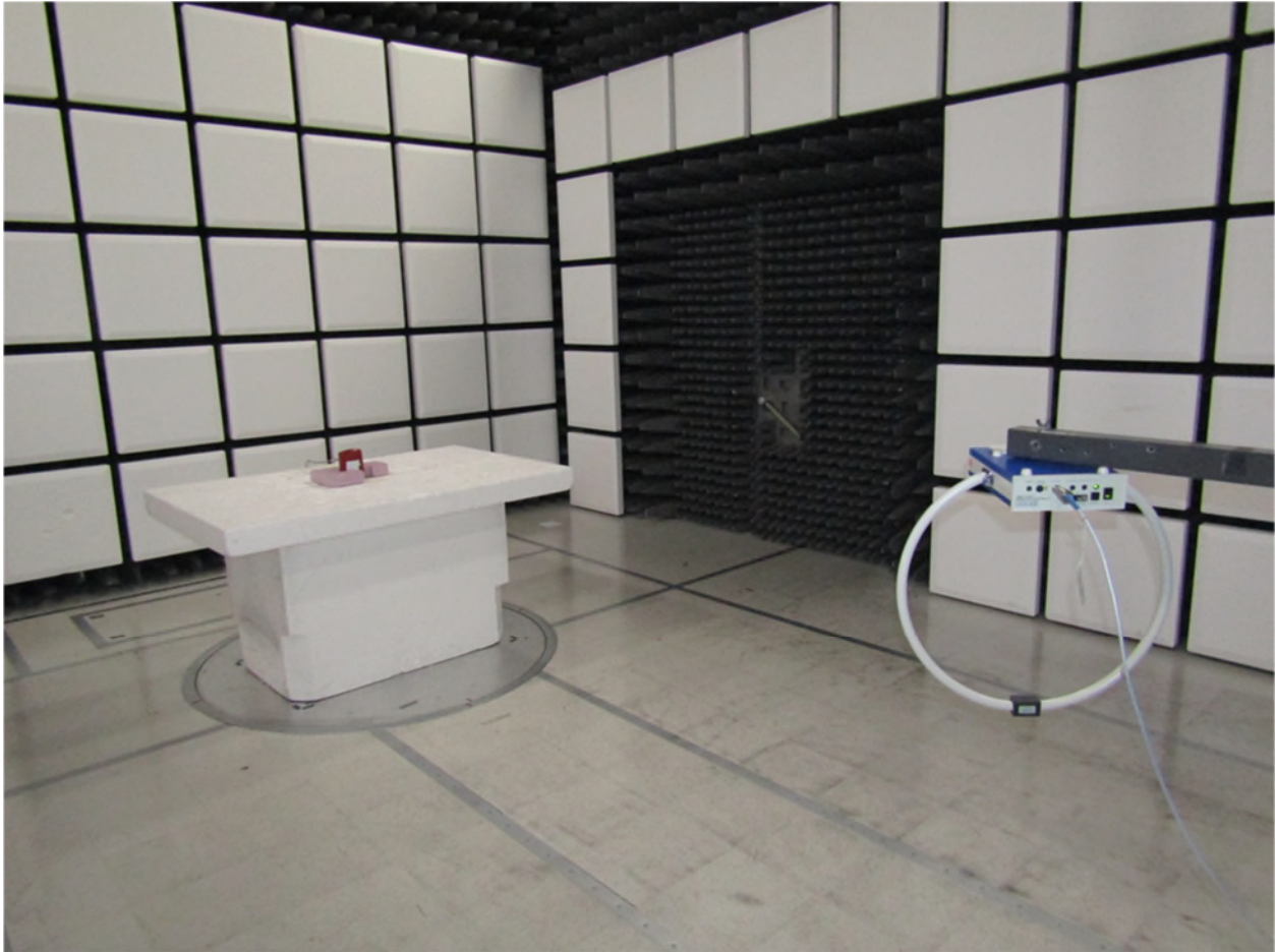
Figure 1: Radiated Emissions – Front – Below 30MHz