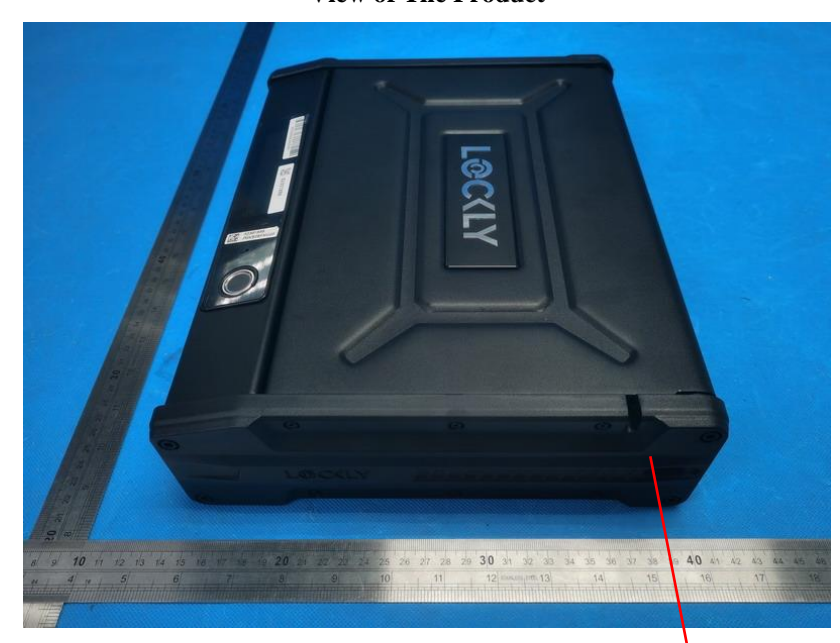
View of The Product