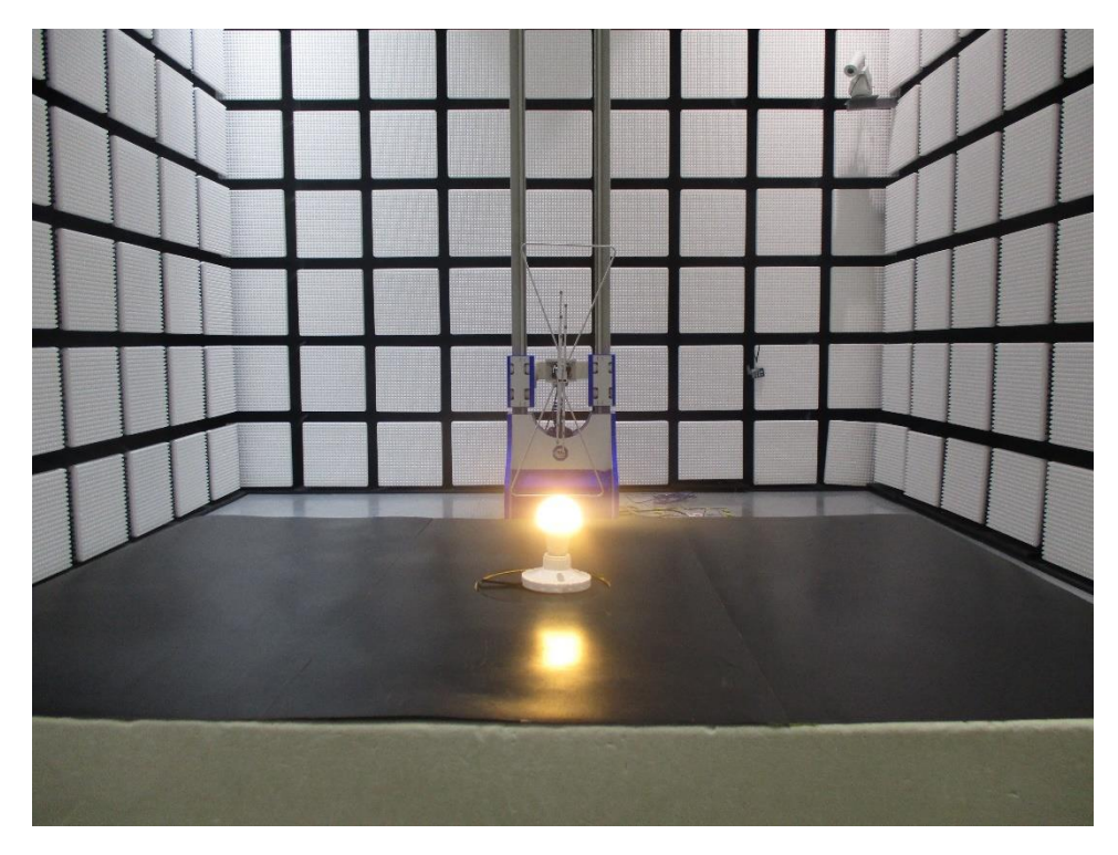
Spurious emission Below 1GHz