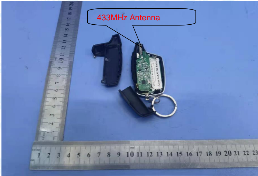
Photo 8 Appearance of PCB