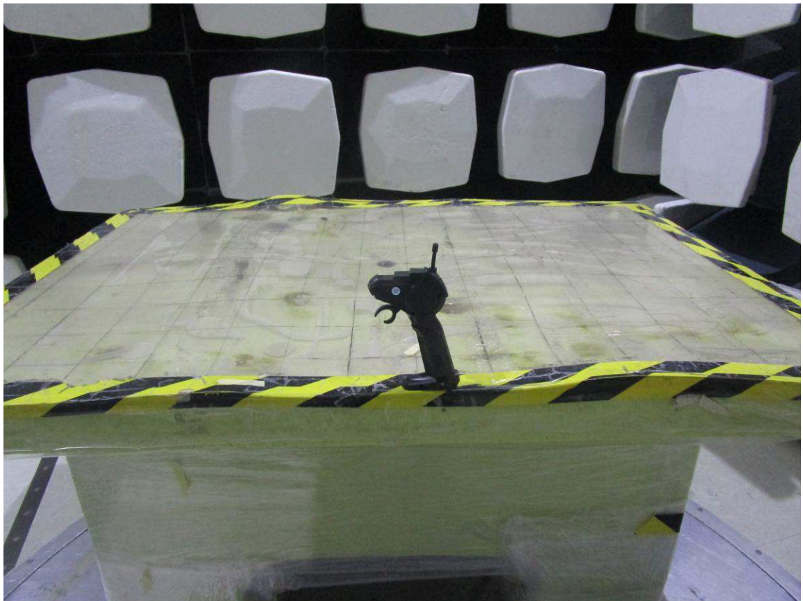
Up to 1GHz (The EUT placed at the center of the turntable)