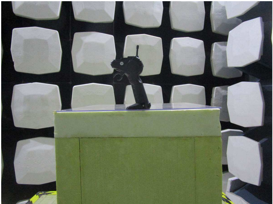
Above 1GHz (The EUT placed at the center of the turntable)